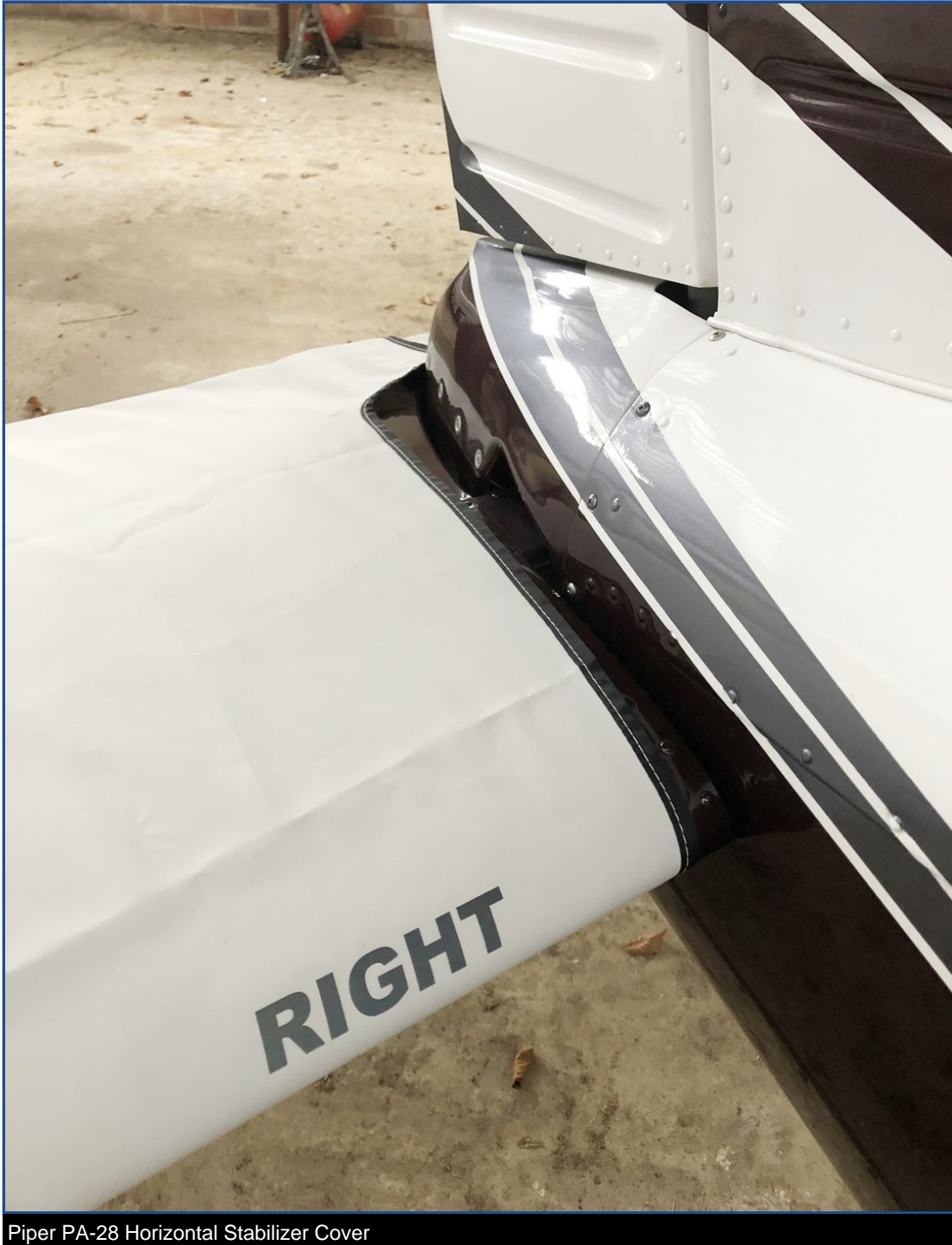
Piper PA-28 Horizontal Stabilizer Cover