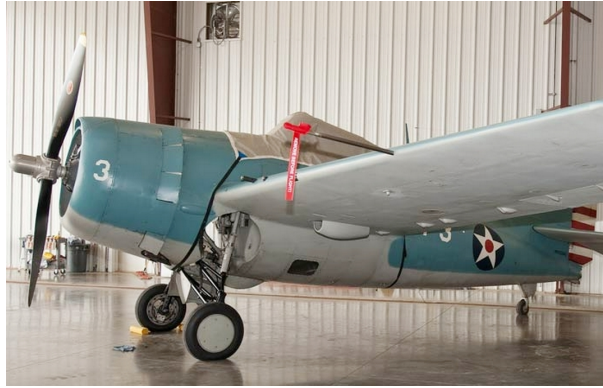
Grumman F4F Wildcat Canopy Cover

Travel Covers are made with Silver Solution-Dyed Polyester fabric and only lined over the windshield to save weight. The material is lightweight and more compact for easy stowage in the aircraft. The polyester material is water resistant, but only intended for occasional use outside. We also have an ultra lightweight material available for fitted hangar dust covers. For daily outdoor use, the non-travel Sunbrella Cover is the best choice.