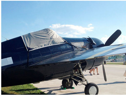
Grumman F4F Wildcat Canopy Cover