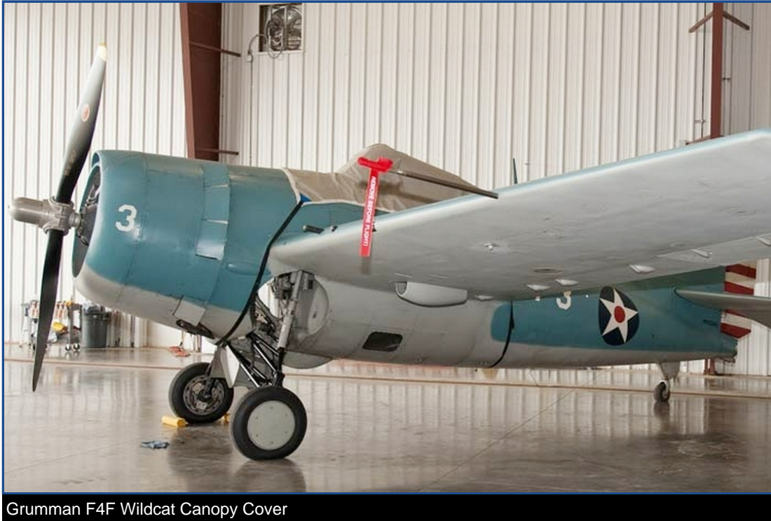
Grumman F4F Wildcat Canopy Cover