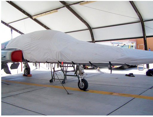
Northup F5 Talon Canopy Cover