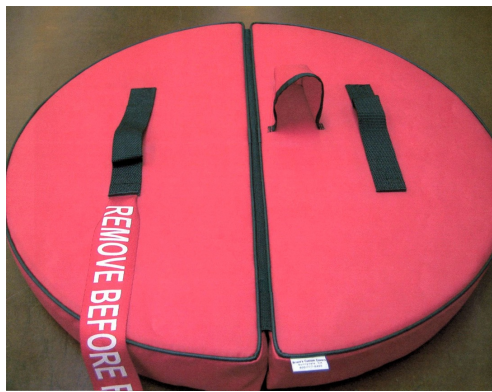
Falcon Center Engine Intake Plug