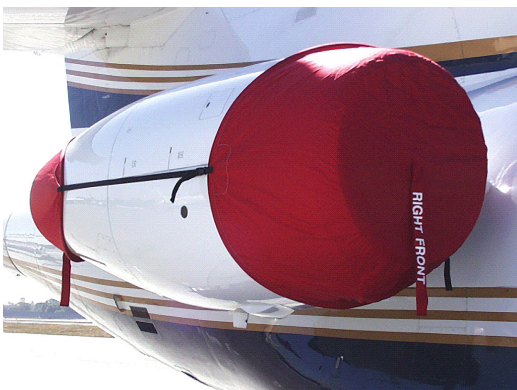
Falcon 50EX Outboard Intake/Exhaust Covers

The Falcon Jet 50EX Bikini Style Engine Covers are a single-piece design using a soft and smooth stretchy and fabric. The cover stretches tightly over both the intake and exhaust, installing quickly and easily. These covers are designed to be used as hangar dust covers and have a useful life of approximately one year.