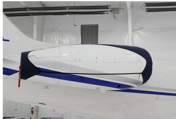
Challenger 300 Intake/Exhaust Cover Set, 3-strap type