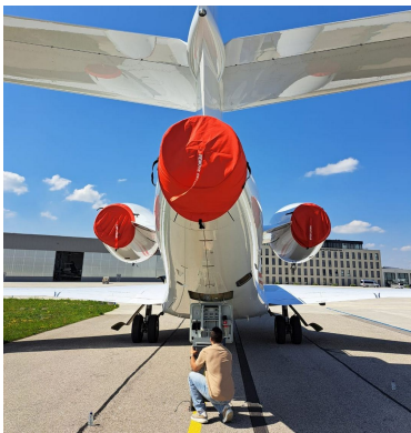
Falcon Jet 7X Intake/Exhaust Covers

The Falcon Jet 7X Intake Covers are designed to install easily yet be completely storable. A spring steel hoop is sewn into the hem of each cover, allowing them to be installed without climbing onto the wing or using a stepladder. To store the covers the spring steel hoop folds like a band-saw blade into three nesting rings. Each cover folds into a compact circular bundle which is stored in the included duffel bag, yet they unfold quickly for use. The Tri-Fold Ring cover is made of medium weight nylon which is available in a variety of colors to match the paint trim. Each cover set comes complete with installation and folding instructions. The aircraft's registration number can be silkscreened onto the cover for an extra charge.