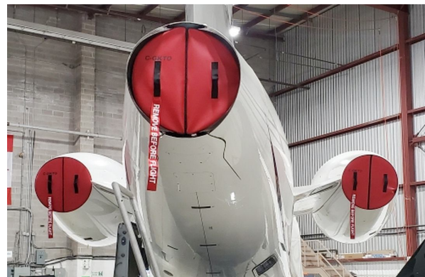
Falcon F7X Exhaust Plugs