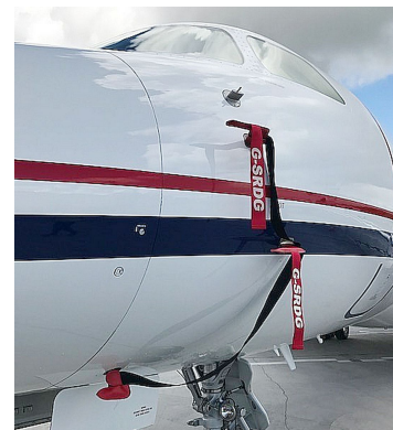
Falcon Jet 7X Pitot Probe/Aoa Set, Heat Resistant Type