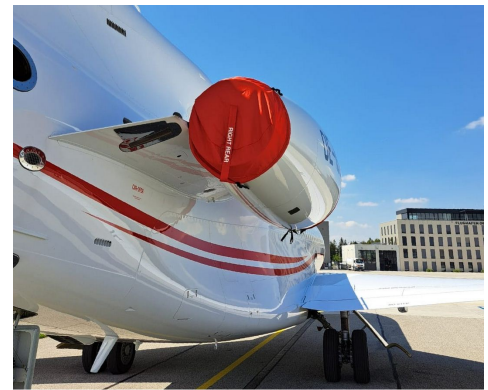
Falcon Jet 7X Intake/Exhaust Covers