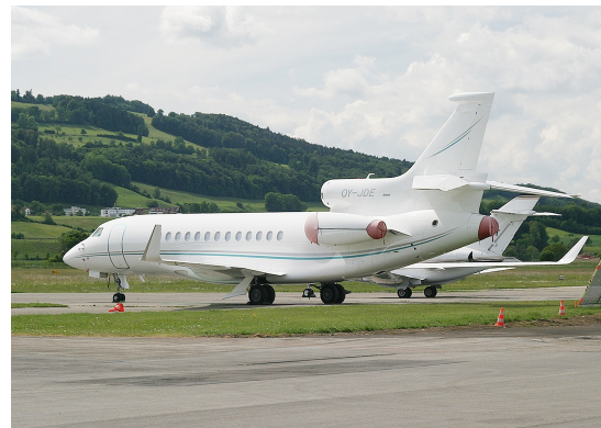
Falcon 7X Engine Cover Set