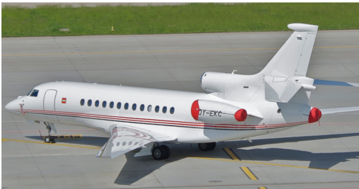
Falcon 7X Engine Cover Set

The Falcon Jet 7X Intake Covers are designed to install easily yet be completely storable. A spring steel hoop is sewn into the hem of each cover, allowing them to be installed without climbing onto the wing or using a stepladder. To store the covers the spring steel hoop folds like a band-saw blade into three nesting rings. Each cover folds into a compact circular bundle which is stored in the included duffel bag, yet they unfold quickly for use. The Tri-Fold Ring cover is made of medium weight nylon which is available in a variety of colors to match the paint trim. Each cover set comes complete with installation and folding instructions. The aircraft's registration number can be silkscreened onto the cover for an extra charge.