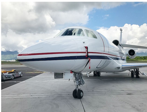
Falcon Jet 7X Pitot Probe/Aoa Set, Heat Resistant Type

The Engine Inlet Plugs are custom fit for your Falcon Jet 7X intakes, made with heavy-duty vinyl material, and stuffed with a single block of sculpted urethane foam. Each plug has a zipper that allows the foam to be removed and dried if necessary. Engine plugs have 'remove before flight' streamers sewn onto the face of the plugs. Most plugs are imprinted with the aircraft registration number in black for an extra charge. Storage bag NOT included. Engine plugs may be inserted after flight when the engine is still warm. Engine Inlet Plugs are commonly referred to as Cowl Plugs, Intake Plugs, Cowl Blocks, Engine Blocks, and Engine Bungs.