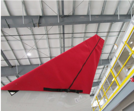
Bombardier Global Express Padded Winglet Covers