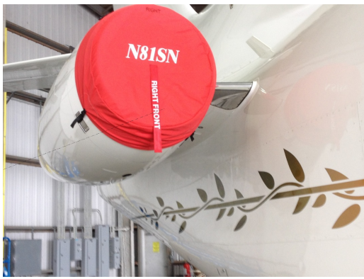
Falcon 900EX Intake Cover