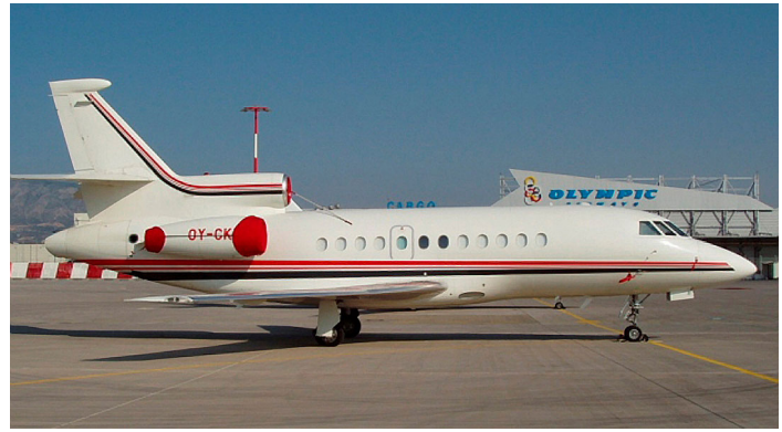
Falcon 900 Engine Covers