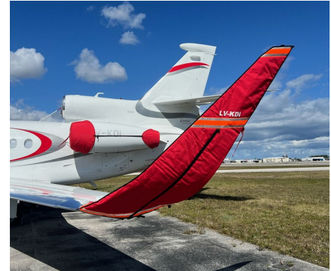
Falcon Jet 900 Winglet Padding Covers