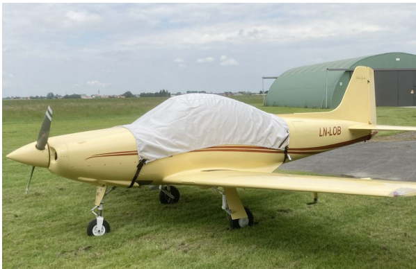
Sequoia Falco Canopy Cover