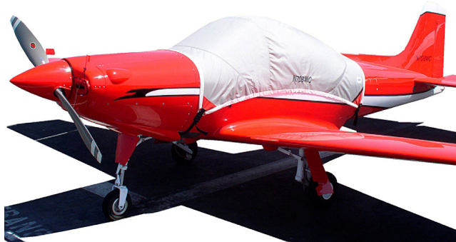
Falco Canopy Cover & Engine Plugs