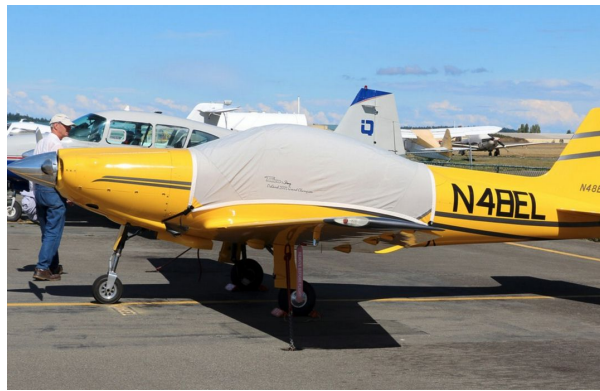
Sequoia Falco Travel Weight Canopy Cover

Travel Covers are made with Silver Solution-Dyed Polyester fabric and only lined over the windshield to save weight. The material is lightweight and more compact for easy stowage in the aircraft. The polyester material is water resistant, but only intended for occasional use outside. We also have an ultra lightweight material available for fitted hangar dust covers. For daily outdoor use, the non-travel Sunbrella Cover is the best choice.