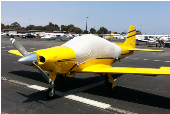
Falco Canopy Cover

This cover type is made from Silver Acrylic Sunbrella canvas and is 100% lined with a soft and smooth microfiber. Bruce's Custom Covers developed this material combination especially for aircraft protection. The outer material is medium weight and treated for water resistance, UV resistance and anti-static buildup. The inner lining is a very soft and smooth microfiber to prevent scratching. The material is very reflective, and tests show that the cabin interior temperature can be reduced to near-ambient temperature on the hottest of days. It is water, ice and snow repellent, yet breathable to allow moisture to escape from between the cover and the aircraft surface.