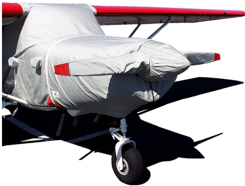
Maule Prop (2 Blade), Engine, & Canopy Cover

This cover type is made from Silver Acrylic Sunbrella canvas and is 100% lined with a soft and smooth microfiber. Bruce's Custom Covers developed this material combination especially for aircraft protection. The outer material is medium weight and treated for water resistance, UV resistance and anti-static buildup. The inner lining is a very soft and smooth microfiber to prevent scratching. The material is very reflective, and tests show that the cabin interior temperature can be reduced to near-ambient temperature on the hottest of days. It is water, ice and snow repellent, yet breathable to allow moisture to escape from between the cover and the aircraft surface.