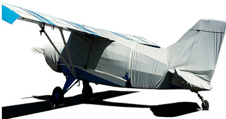
Maule Empennage, Engine & Prop Covers

WINTER USE MATERIAL - Made with Solution-Dyed Polyester fabric, this option is intended for seasonal use to aid in deicing, rain mitigation, or for occasional travel. The material is lighter and more compact, but more susceptible to UV damage and may have a shorter useful life if used continuously outside than the all-year use material.