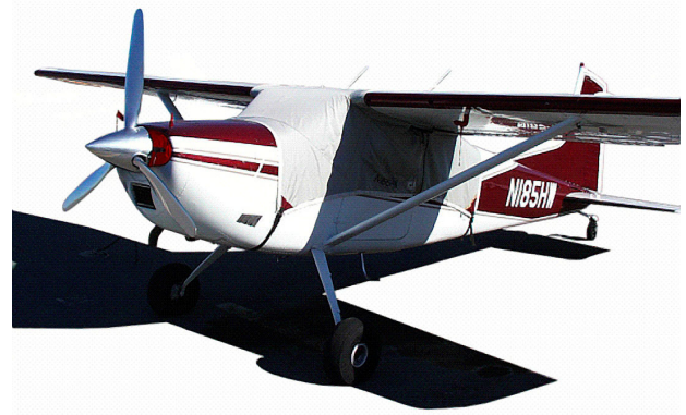
Cessna 185 Over-the-Top Canopy Cover