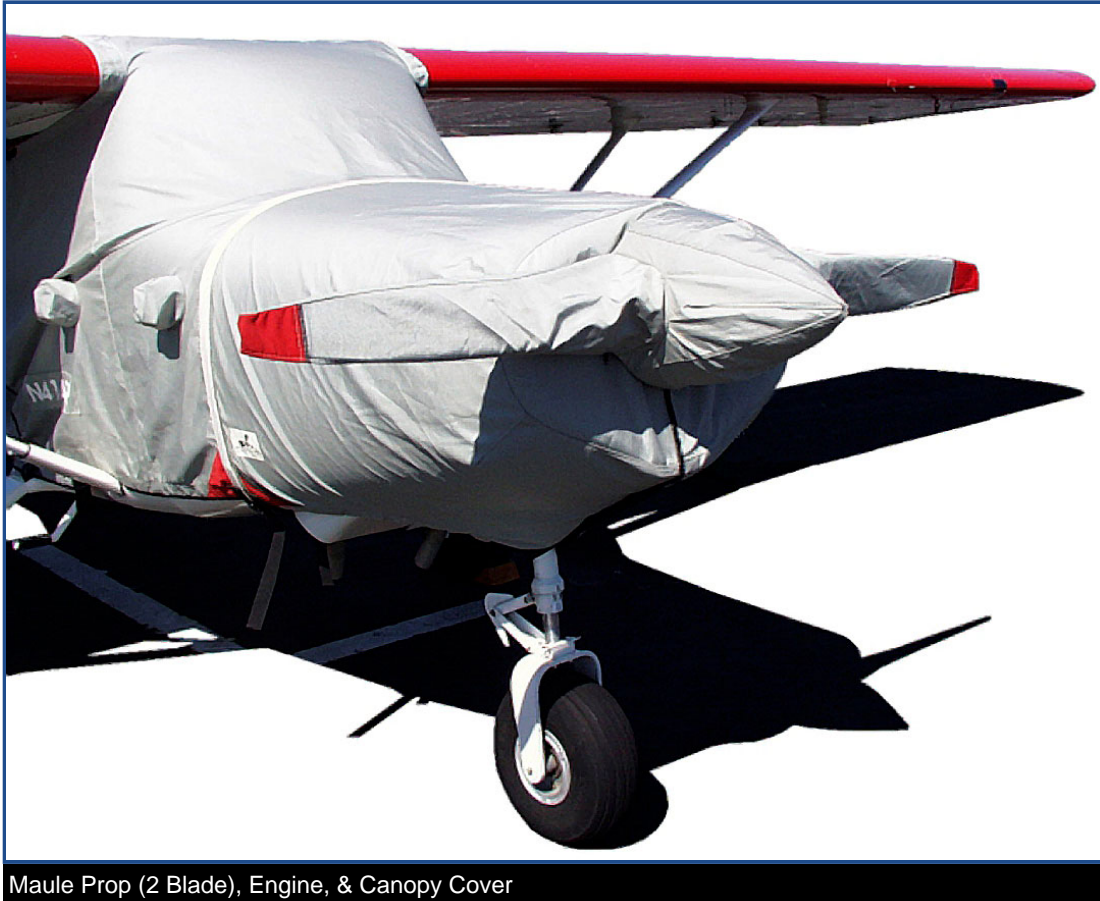
Maule Prop (2 Blade), Engine, & Canopy Cover