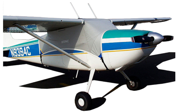
Cessna 180 Canopy Cover