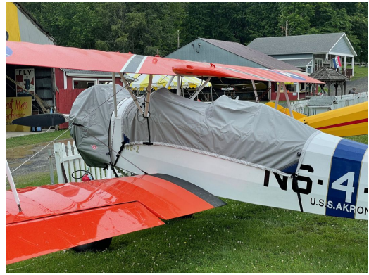
Fleet Biplane Model 1 Canopy & Engine Covers