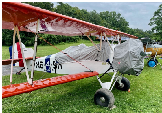
Fleet Biplane Model 1 Canopy & Engine Covers