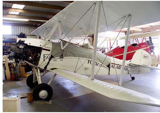
Fairchild KR-34 Canopy Cover