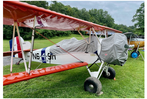
Fleet Biplane Model 1 Canopy & Engine Covers