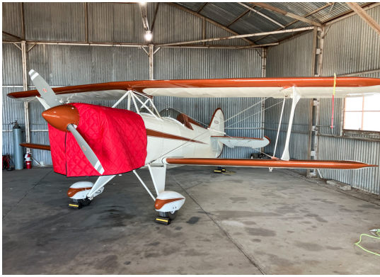
SKYBOLT, Insulated Hangar Blanket, Custom Fit Interior Use)