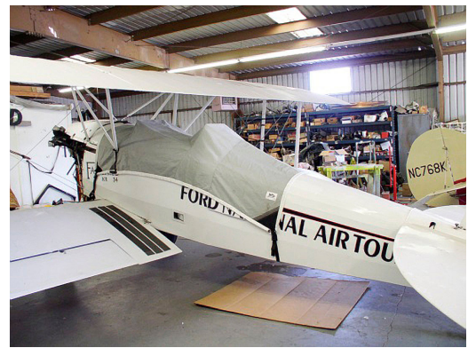
Fairchild KR-34 Canopy Cover