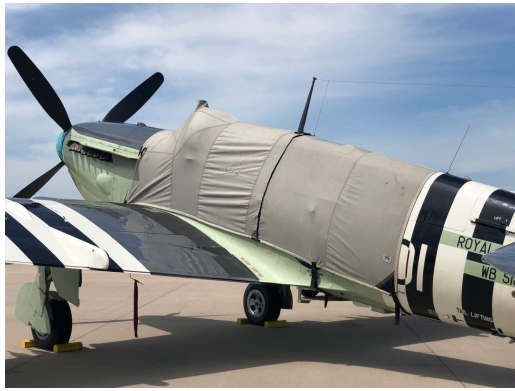
Fairey Firefly Canopy Cover