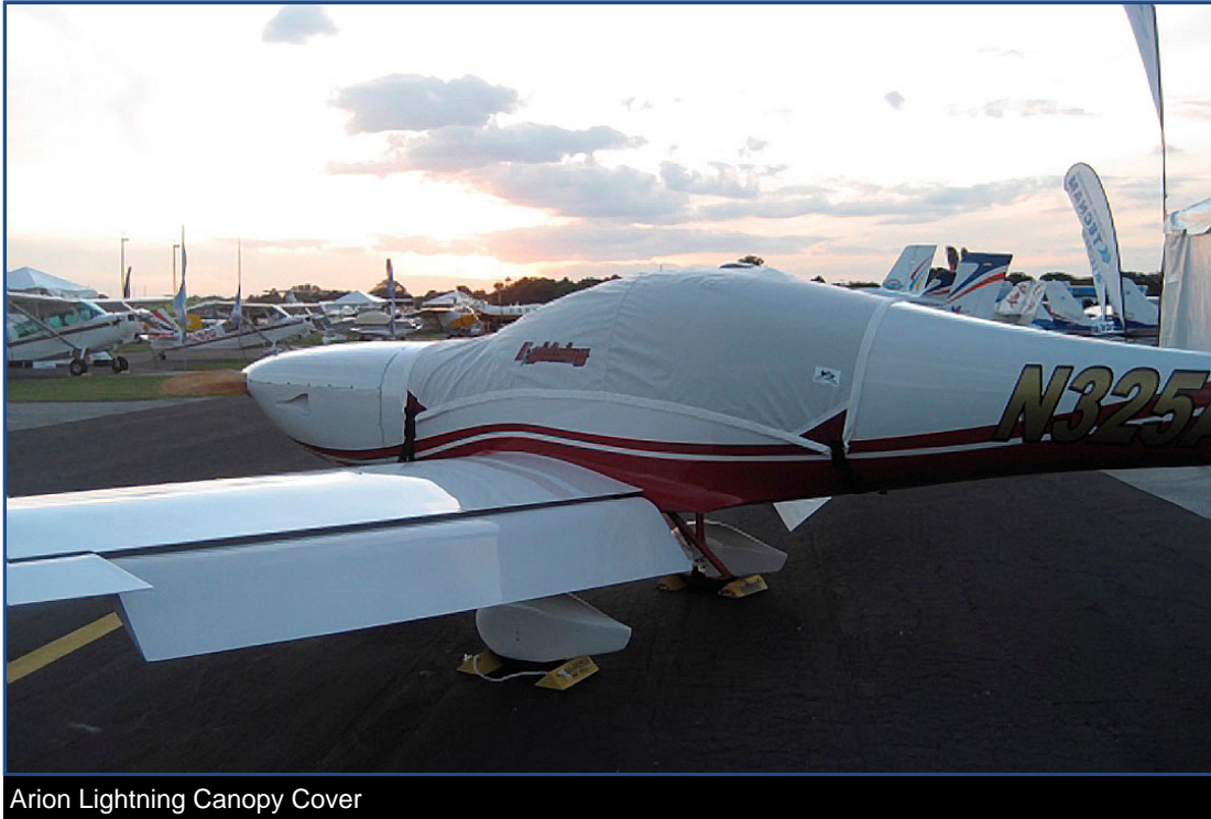
Arion Lightning Canopy Cover