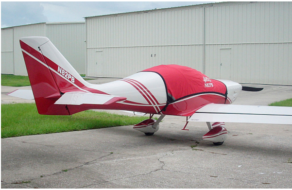
Lightning Canopy Cover