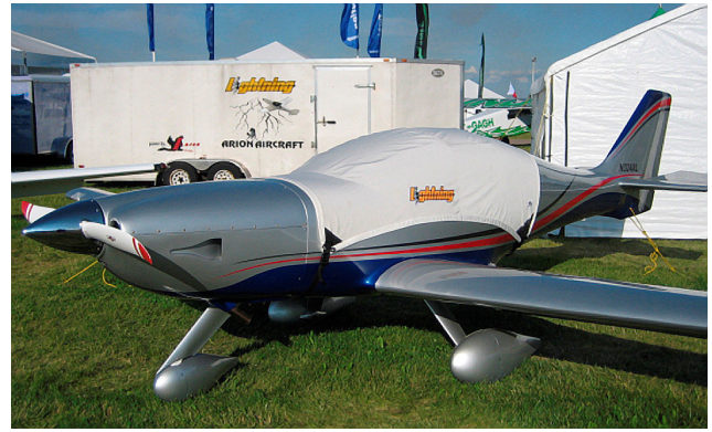
Lightning Canopy Cover