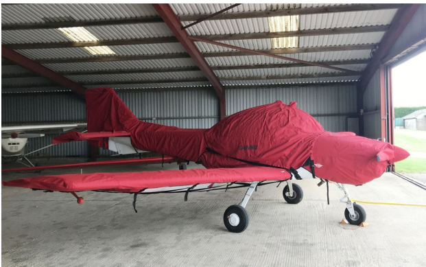
FLS Club Sprint Extended Canopy Cover

Engine Covers will cinch around or behind the spinner, cover the entire engine cowl area including the engine air cooling and induction air inlets, and fastens together with Velcro beneath the spinner down the front of the cowling. The Engine Cover is attached with a belly strap aft of the firewall, and can Velcro to the Canopy Cover. Engine Covers are normally made from Solution-Dyed Polyester or Acrylic Sunbrella . An Insulated version of the engine cover can be made with a thicker, quilted, and water-repellent material. The Insulated Engine Cover works well in cold climates to help with engine preheating.