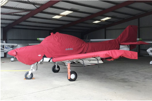
FLS Club Sprint Engine Cover

Covers developed this material combination especially for aircraft protection. The outer material is medium weight and treated for water resistance, UV resistance and anti-static buildup. The inner lining is a very soft and smooth microfiber to prevent scratching. The material is very reflective, and tests show that the cabin interior temperature can be reduced to near-ambient temperature on the hottest of days. It is water, ice and snow repellent, yet breathable to allow moisture to escape from between the cover and the aircraft surface.