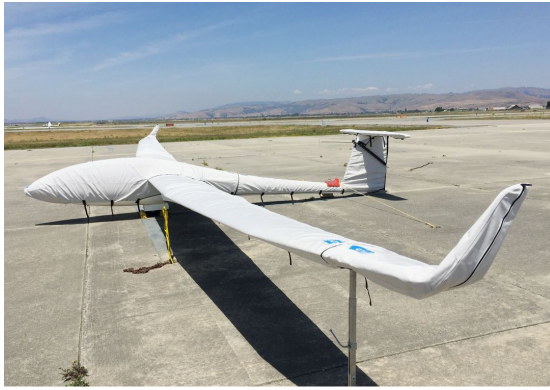
Schemp-Hirth Discus 2B Full Cover Set

the hottest of days. It is water, ice and snow repellent, yet breathable to allow moisture to escape from between the cover and the aircraft surface.