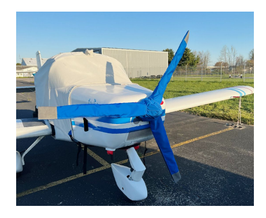
S C Aerostar Festival Prop Cover, Extended Canopy Cover