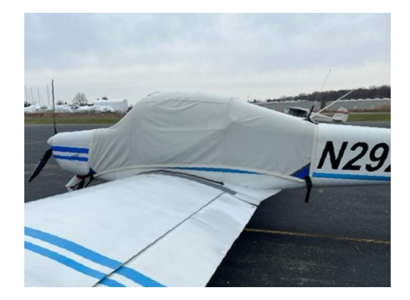
SC Aerostar Festival Canopy Cover

This cover type is made from Silver Acrylic Sunbrella canvas and is 100% lined with a soft and smooth microfiber. Bruce's Custom Covers developed this material combination especially for aircraft protection. The outer material is medium weight and treated for water resistance, UV resistance and anti-static buildup. The inner lining is a very soft and smooth microfiber to prevent scratching. The material is very reflective, and tests show that the cabin interior temperature can be reduced to near-ambient temperature on the hottest of days. It is water, ice and snow repellent, yet breathable to allow moisture to escape from between the cover and the aircraft surface.