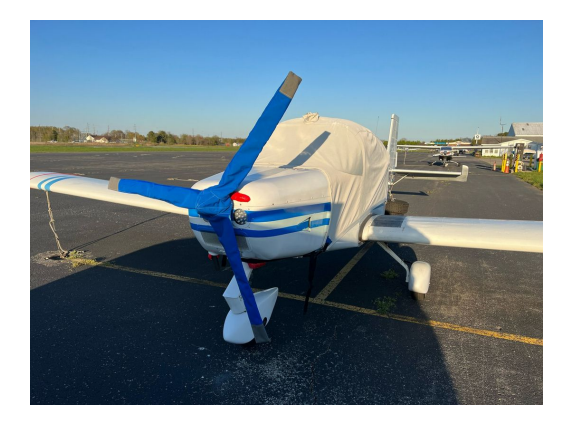
S C Aerostar Festival Prop Cover, Extended Canopy Cover

This cover type is made from Silver Acrylic Sunbrella canvas and is 100% lined with a soft and smooth microfiber. Bruce's Custom Covers developed this material combination especially for aircraft protection. The outer material is medium weight and treated for water resistance, UV resistance and anti-static buildup. The inner lining is a very soft and smooth microfiber to prevent scratching. The material is very reflective, and tests show that the cabin interior temperature can be reduced to near-ambient temperature on the hottest of days. It is water, ice and snow repellent, yet breathable to allow moisture to escape from between the cover and the aircraft surface.