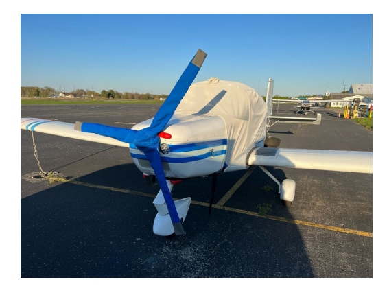
S C Aerostar Festival Prop Cover, Extended Canopy Cover