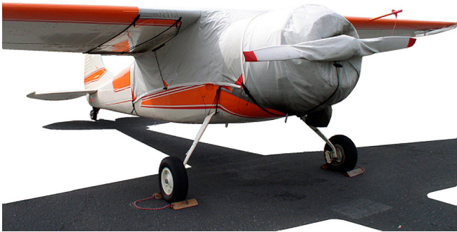
Cessna 195 Canopy Cover, over-top, 24" fwd ext to cover cowl ring gap, gas cap ext. Cessna 195 Over-Top Canopy, Engine & Prop Covers