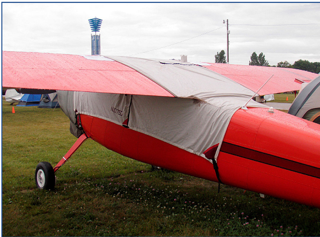
Over-Top Canopy Cover &amp; Engine Cover