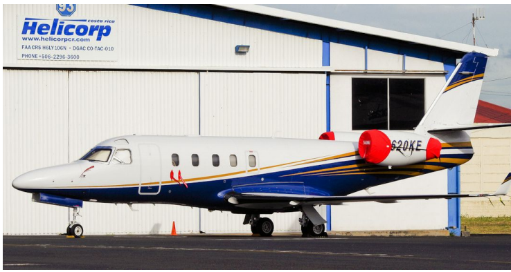
Gulfstream G100 Engine Covers with TR's and imprint