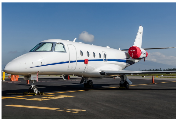
Gulfstream G150 Engine Covers, Cockpit HeatShields