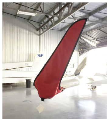
Schleicher ASH Wingtip Pads