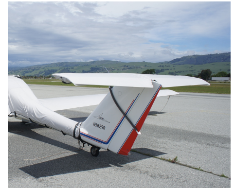
Grob 109 Horizontal Stabilizer Cover