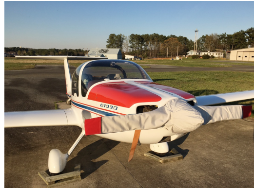
Grob 109 Prop Cover