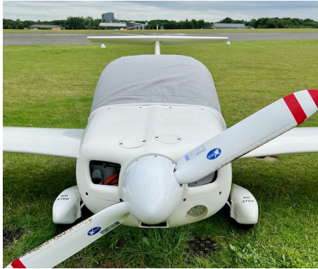
Grob 109 Travel Cover, Light Weight Canopy Cover