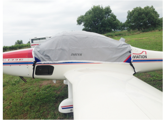
Grob 109 Travel Cover, Light Weight Travel Canopy Cover