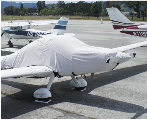
Grob 109 Prop Cover