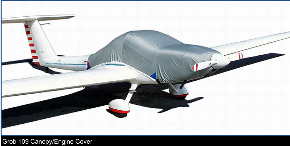
Grob 109 Canopy/Engine Cover