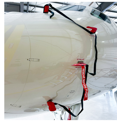
Gulfstream GVII Pitot Probes/TAT/Ice Detector Set, Heat Resistant Type