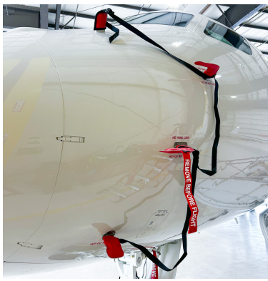
Gulfstream GVII Pitot Probes/TAT/Ice Detector Set, Heat Resistant Type