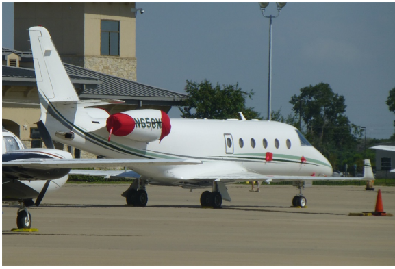
Gulfstream G150 Engine Cover Set