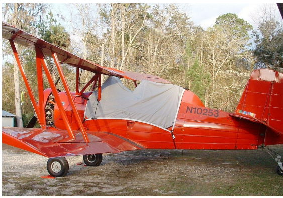
Grumman Ag Cat G-164, Open Cockpit, Canopy Cover