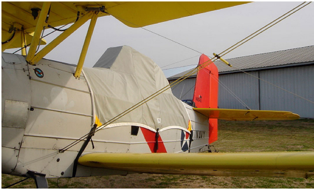
Ag-Cat Canopy Cover