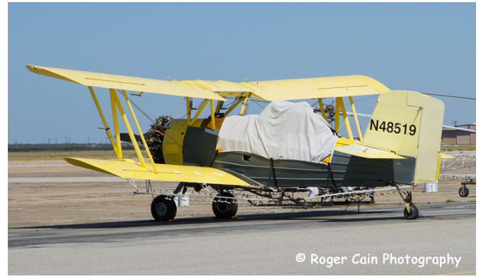
Grumman AG Cat Canopy Cover