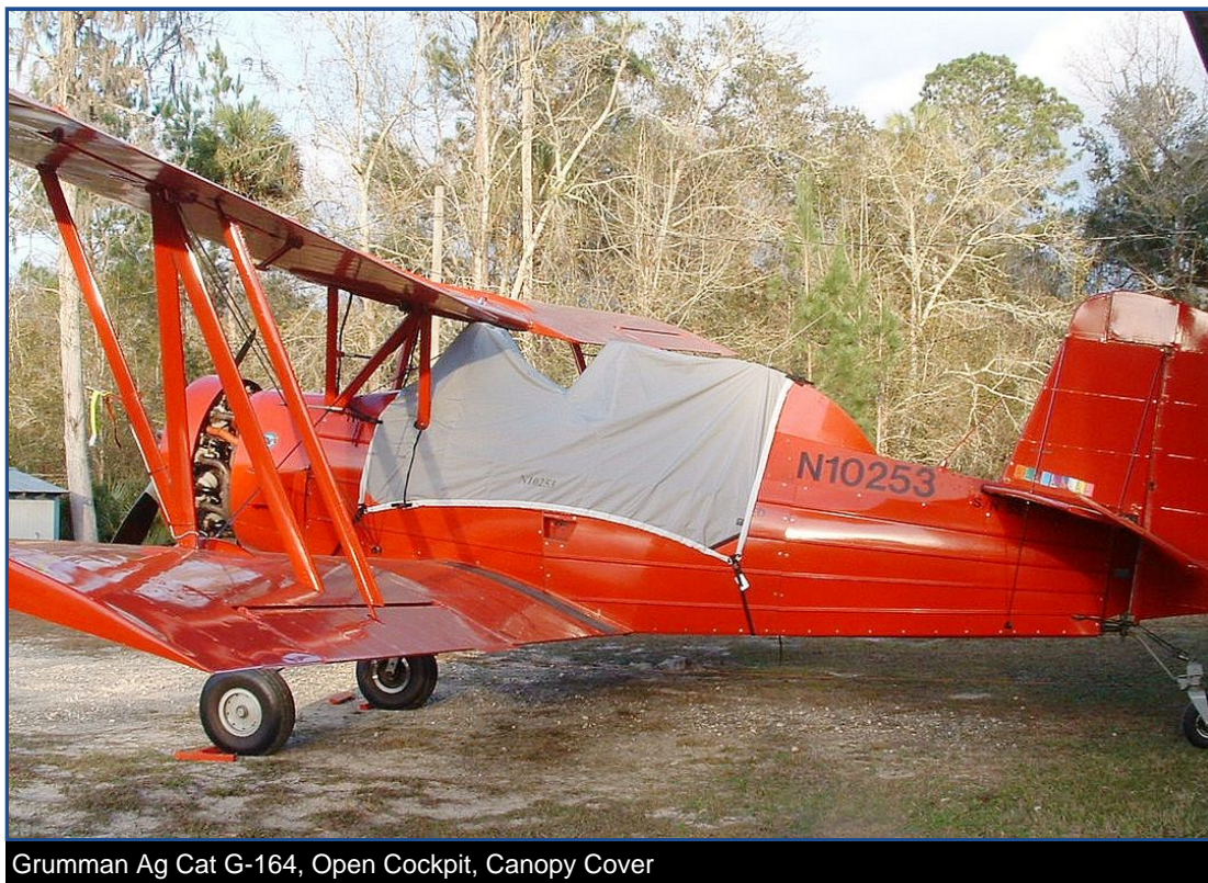
Grumman Ag Cat G-164, Open Cockpit, Canopy Cover