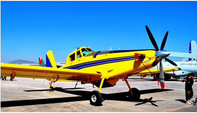
Air Tractor Prop Tie/Exhaust Covers