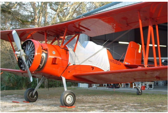
Grumman Ag Cat G-164, Open Cockpit, Canopy Cover