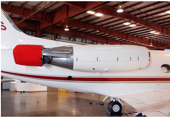
Stage III Quiet Technologies Hush Kit Cover

The Gulfstream Aerospace Gulfstream II, III (C-20D) Intake Covers are designed to install easily yet be completely storable. A spring steel hoop is sewn into the hem of each cover, allowing them to be installed without climbing onto the wing or using a stepladder. To store the covers the spring steel hoop folds like a band-saw blade into three nesting rings. Each cover folds into a compact circular bundle which is stored in the included duffle bag, yet they unfold quickly for use. The Tri-Fold Ring cover is made of medium weight nylon which is available in a variety of colors to match the paint trim. Each cover set comes complete with installation and folding instructions. The aircraft's registration number can be silkscreened onto the cover for an extra charge.