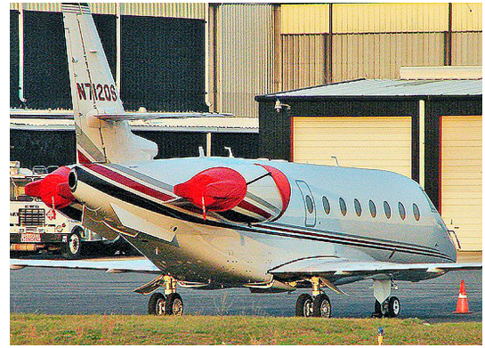
Gulfstream 200 Engine Cover set