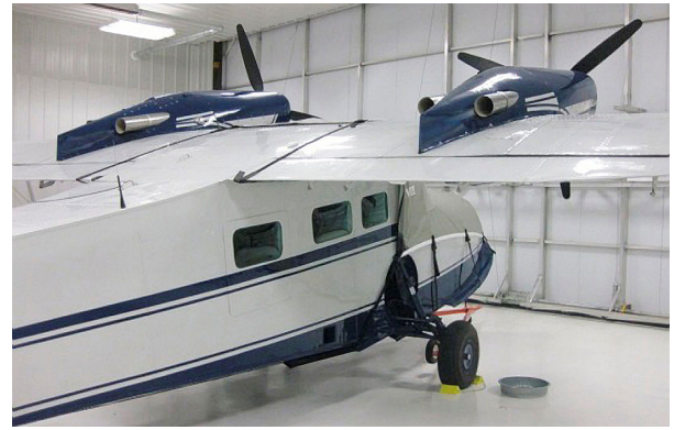
Grumman G44 Widgeon Cockpit/Nose Cover