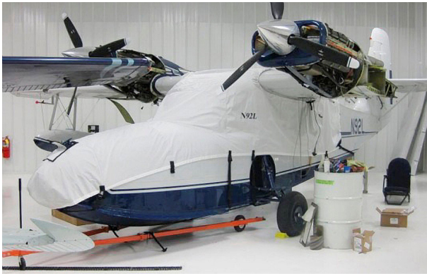
Grumman G44 Widgeon Canopy/Nose Cover