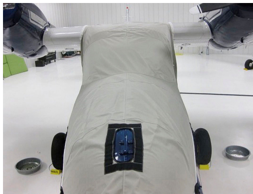
Grumman Widgeon Cockpit/Nose Cover, tie-down cleat detail