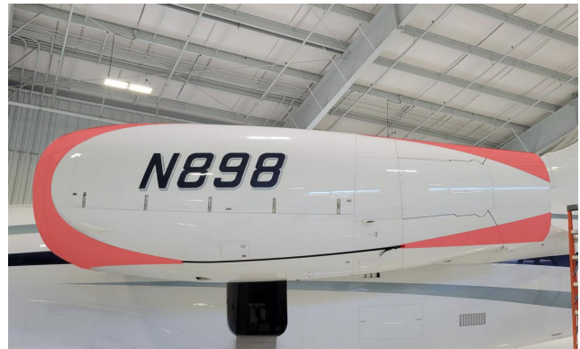
Challenger 300 Intake/Exhaust Cover Set, 3-strap type Gulfstream Aerospace G-IV (G350), Intake/Exhaust Cover, test fit cover