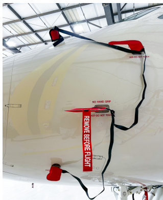
Gulfstream GVII Pitot Probes/TAT/Ice Detector Set, Heat Resistant Type

The Engine Inlet Plugs are custom fit for your Gulfstream Aerospace Gulfstream IV (C-20G), G350, G450 intakes, made with heavy-duty vinyl material, and stuffed with a single block of sculpted urethane foam. Each plug has a zipper that allows the foam to be removed and dried if necessary. Engine plugs have 'remove before flight' streamers sewn onto the face of the plugs. Most plugs are imprinted with the aircraft registration number in black for an extra charge. Storage bag NOT included. Engine plugs may be inserted after flight when the engine is still warm. Engine Inlet Plugs are commonly referred to as Cowl Plugs, Intake Plugs, Cowl Blocks, Engine Blocks, and Engine Bungs.