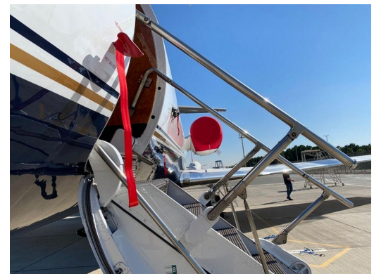
Grumman Gulfstream G-IV SP Pitot Cover