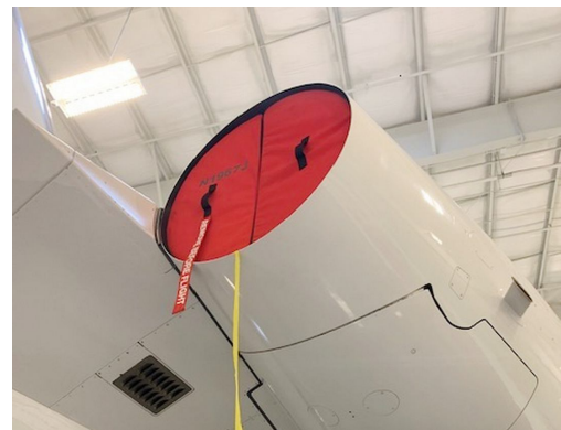
Grumman Gulfstream G-V Exhaust Plugs