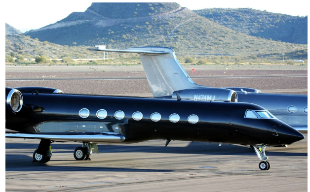
Gulfstream Cockpit Heatshields