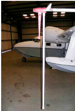
Grumman Mallard Pitot Cover with Install Tool

Canopy Covers are commonly referred to as Cabin Covers, Fuselage Covers, Canvas Covers, Canopy Caps, etc.