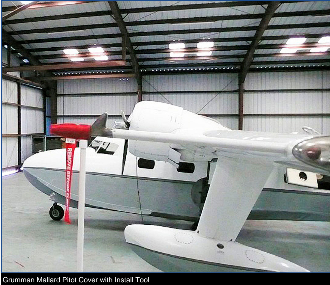
Grumman Mallard Pitot Cover with Install Tool