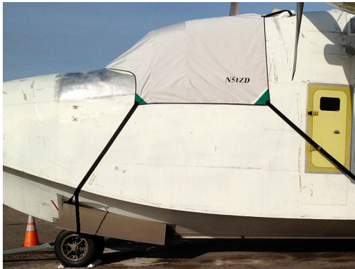
Grumman HU-16 Albatross Canopy Cover