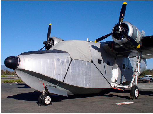
Canopy Cover for the Grumman HU-16 Albatross

Canopy Covers are commonly referred to as Cabin Covers, Fuselage Covers, Canvas Covers, Canopy Caps, etc.