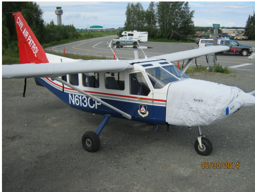
Gippsland GA-8 Airvan Insulated Engine, Wing and Prop Covers