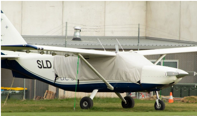
Gippsland GA-8 Canopy Cover

This cover type is made from Silver Acrylic Sunbrella canvas and is 100% lined with a soft and smooth microfiber. Bruce's Custom Covers developed this material combination especially for aircraft protection. The outer material is medium weight and treated for water resistance, UV resistance and anti-static buildup. The inner lining is a very soft and smooth microfiber to prevent scratching. The material is very reflective, and tests show that the cabin interior temperature can be reduced to near-ambient temperature on the hottest of days. It is water, ice and snow repellent, yet breathable to allow moisture to escape from between the cover and the aircraft surface.