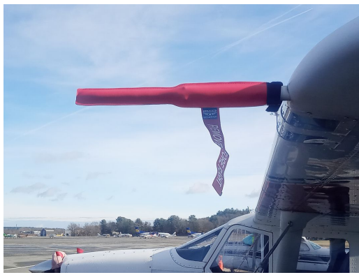
Gippsland GA-8 Airvan Pitot Cover