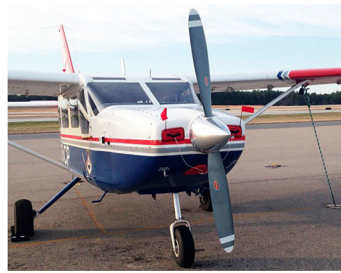
GA-8 Engine Inlet Plugs (set of 3)