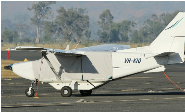
Gippsland GA-8 Airvan Extended Canopy Cover