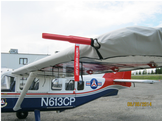
Gippsland GA-8 Airvan Wing Covers, Pitot Cover