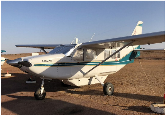
Gippsland GA-8 Airvan

Cockpit Heatshields are interior sunshades for the aircraft's cockpit. The product is a unique composite of closed-cell foam with a silver mylar finish. The semi-rigid design is stiff enough to stand inside the window framing. The set folds up flat and is easily stored in the included storage sleeve. Some designs may require velcro and suction cups. A Heatshield is an excellent short-term remedy for cockpit overheating, but an external fabric cover is more effective for long-term protection.