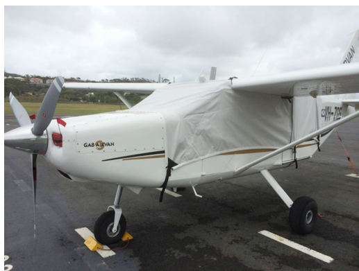
Gippsland GA-8 Airvan Canopy Cover

This cover type is made from Silver Acrylic Sunbrella canvas and is 100% lined with a soft and smooth microfiber. Bruce's Custom Covers developed this material combination especially for aircraft protection. The outer material is medium weight and treated for water resistance, UV resistance and anti-static buildup. The inner lining is a very soft and smooth microfiber to prevent scratching. The material is very reflective, and tests show that the cabin interior temperature can be reduced to near-ambient temperature on the hottest of days. It is water, ice and snow repellent, yet breathable to allow moisture to escape from between the cover and the aircraft surface.