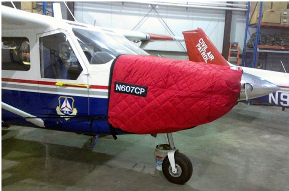
GA-8 Insulated Engine Cover

This cover type is made from Silver Acrylic Sunbrella canvas and is 100% lined with a soft and smooth microfiber. Bruce's Custom Covers developed this material combination especially for aircraft protection. The outer material is medium weight and treated for water resistance, UV resistance and anti-static buildup. The inner lining is a very soft and smooth microfiber to prevent scratching. The material is very reflective, and tests show that the cabin interior temperature can be reduced to near-ambient temperature on the hottest of days. It is water, ice and snow repellent, yet breathable to allow moisture to escape from between the cover and the aircraft surface.