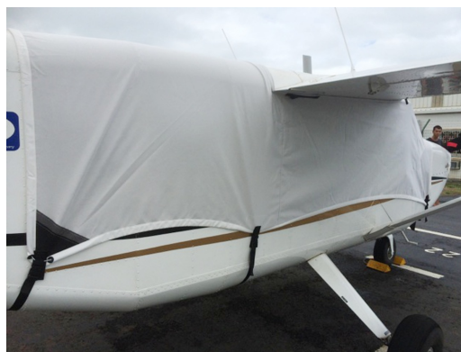
Gippsland GA-8 Airvan Canopy Cover