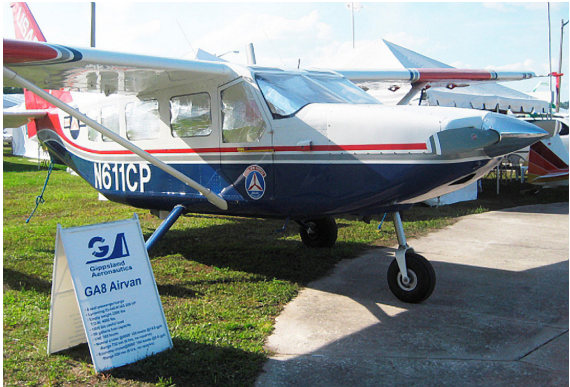
Gippsland GA-8 Airvan Cockpit & Cabin HeatShield Set