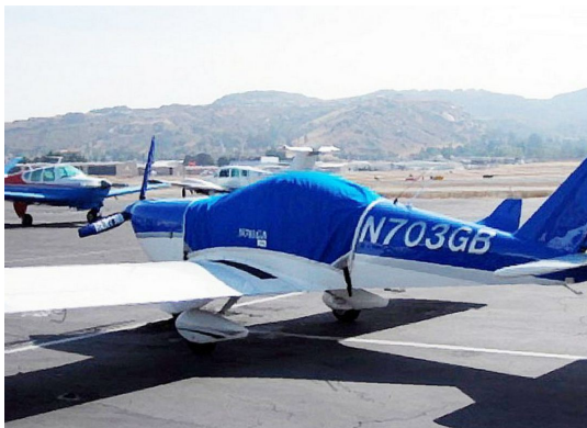
Gobosh 700S Canopy Cover (comes in colors)

This cover type is made from Silver Acrylic Sunbrella canvas and is 100% lined with a soft and smooth microfiber. Bruce's Custom Covers developed this material combination especially for aircraft protection. The outer material is medium weight and treated for water resistance, UV resistance and anti-static buildup. The inner lining is a very soft and smooth microfiber to prevent scratching. The material is very reflective, and tests show that the cabin interior temperature can be reduced to near-ambient temperature on the hottest of days. It is water, ice and snow repellent, yet breathable to allow moisture to escape from between the cover and the aircraft surface.