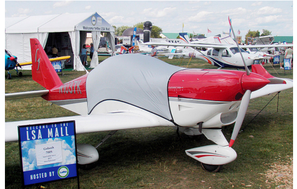
Gobosh GB7 Light Weight Travel-Cover