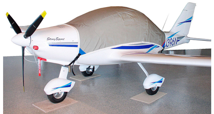
Sting Sport Canopy Cover & Engine Plugs