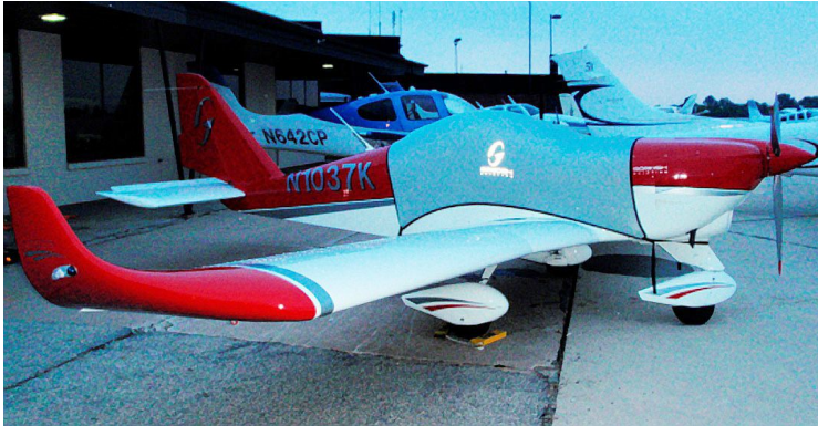
Gobosh Light Weight Travel-Cover

Travel Covers are made with Silver Solution-Dyed Polyester fabric and only lined over the windshield to save weight. The material is lightweight and more compact for easy stowage in the aircraft. The polyester material is water resistant, but only intended for occasional use outside. We also have an ultra lightweight material available for fitted hangar dust covers. For daily outdoor use, the non-travel Sunbrella Cover is the best choice.