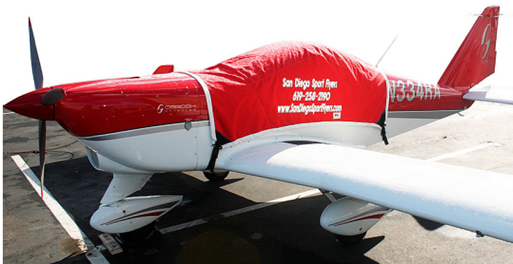
Gobosh Canopy Cover with custom Imprint

This cover type is made from Silver Acrylic Sunbrella canvas and is 100% lined with a soft and smooth microfiber. Bruce's Custom Covers developed this material combination especially for aircraft protection. The outer material is medium weight and treated for water resistance, UV resistance and anti-static buildup. The inner lining is a very soft and smooth microfiber to prevent scratching. The material is very reflective, and tests show that the cabin interior temperature can be reduced to near-ambient temperature on the hottest of days. It is water, ice and snow repellent, yet breathable to allow moisture to escape from between the cover and the aircraft surface.