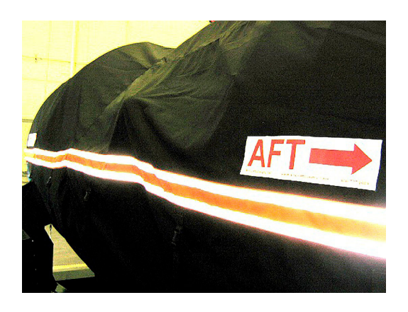
GE90-115 Propulsor QEC Engine Long-term Storage/Transport Cover "Bag" Boeing 777