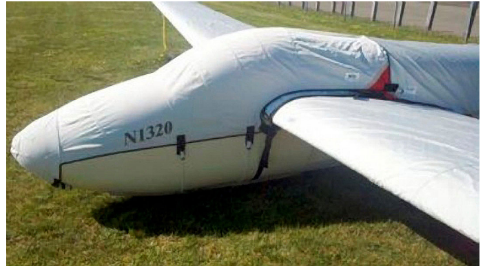
Schweizer SGS 1-26B Canopy/Nose, Wings & Empennage Covers