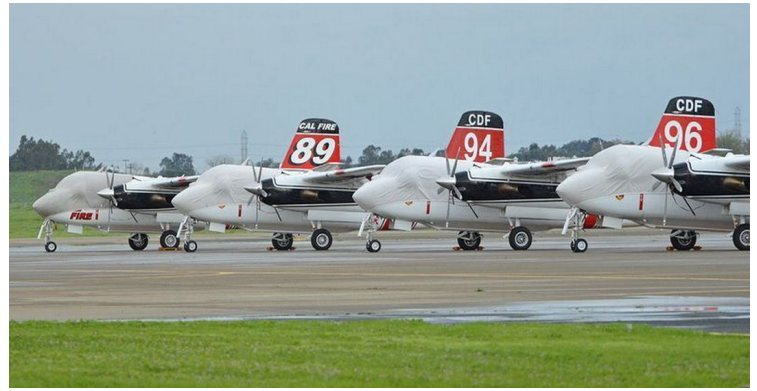
Grumman S2 Tracker Canopy/Nose Covers