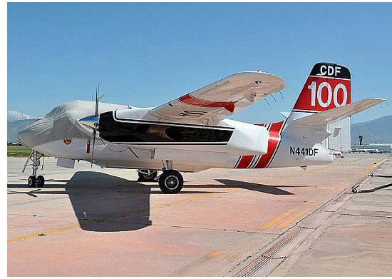
Grumman Tracker (turbine model) Canopy/Nose Cover