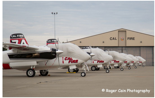
Grumman S-2 Tracker Canopy/Nose Cover