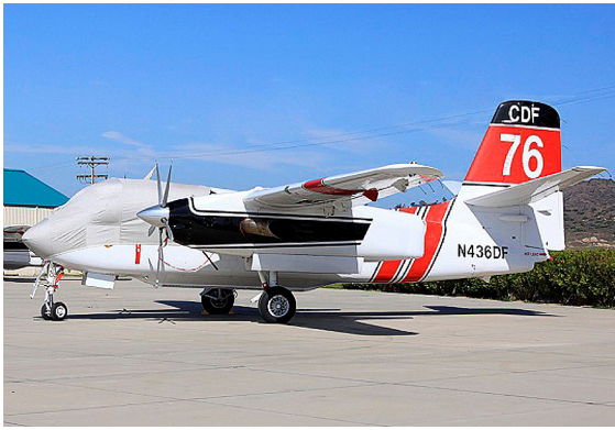
Grumman Tracker (turbine model) Canopy/Nose Cover