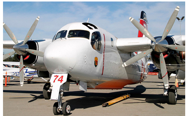
Grumman Tracker Engine Inlet Plugs