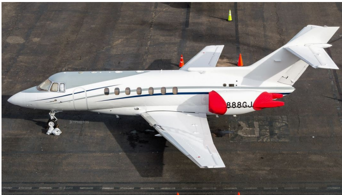
Hawker 1000 Engine Covers

The Hawker Beechcraft 1000 Intake Covers are designed to install easily yet be completely storable. A spring steel hoop is sewn into the hem of each cover, allowing them to be installed without climbing onto the wing or using a stepladder. To store the covers the spring steel hoop folds like a band-saw blade into three nesting rings. Each cover folds into a compact circular bundle which is stored in the included duffle bag, yet they unfold quickly for use. The Tri-Fold Ring cover is made of medium weight nylon which is available in a variety of colors to match the paint trim. Each cover set comes complete with installation and folding instructions. The aircraft's registration number can be silkscreened onto the cover for an extra charge.