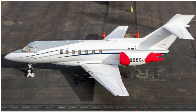
Hawker 1000 Engine Covers

The Hawker Beechcraft 1000 Intake Covers are designed to install easily yet be completely storable. A spring steel hoop is sewn into the hem of each cover, allowing them to be installed without climbing onto the wing or using a stepladder. To store the covers the spring steel hoop folds like a band-saw blade into three nesting rings. Each cover folds into a compact circular bundle which is stored in the included duffle bag, yet they unfold quickly for use. The Tri-Fold Ring cover is made of medium weight nylon which is available in a variety of colors to match the paint trim. Each cover set comes complete with installation and folding instructions. The aircraft's registration number can be silkscreened onto the cover for an extra charge.