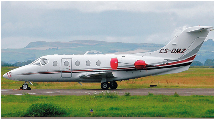
Beechjet 400 Engine & Pitot Covers