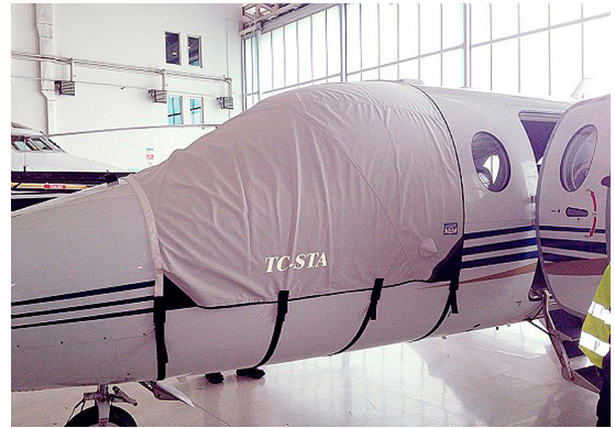
Beechjet 400A Cockpit Cover