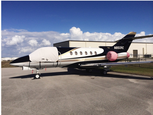
Hawker 800 Cockpit Cover, extended aft 24"

This cover type is made from Silver Acrylic Sunbrella canvas and is 100% lined with a soft and smooth microfiber. Bruce's Custom Covers developed this material combination especially for aircraft protection. The outer material is medium weight and treated for water resistance, UV resistance and anti-static buildup. The inner lining is a very soft and smooth microfiber to prevent scratching. The material is very reflective, and tests show that the cabin interior temperature can be reduced to near-ambient temperature on the hottest of days. It is water, ice and snow repellent, yet breathable to allow moisture to escape from between the cover and the aircraft surface.