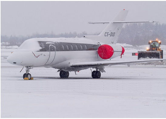
Hawker 750 Engine Cover set