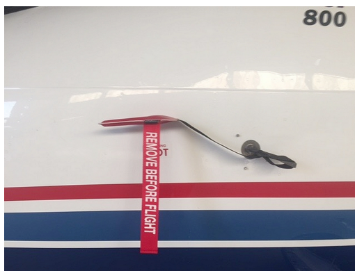
Hawker Beechcraft 800, 800XP, 850XP Pitot Covers With Aoa Straps

The Engine Inlet Plugs are custom fit for your British Aerospace Hawker 700 intakes, made with heavy-duty vinyl material, and stuffed with a single block of sculpted urethane foam. Each plug has a zipper that allows the foam to be removed and dried if necessary. Engine plugs have 'remove before flight' streamers sewn onto the face of the plugs. Most plugs are imprinted with the aircraft registration number in black for an extra charge. Storage bag NOT included. Engine plugs may be inserted after flight when the engine is still warm. Engine Inlet Plugs are commonly referred to as Cowl Plugs, Intake Plugs, Cowl Blocks, Engine Blocks, and Engine Bunges.