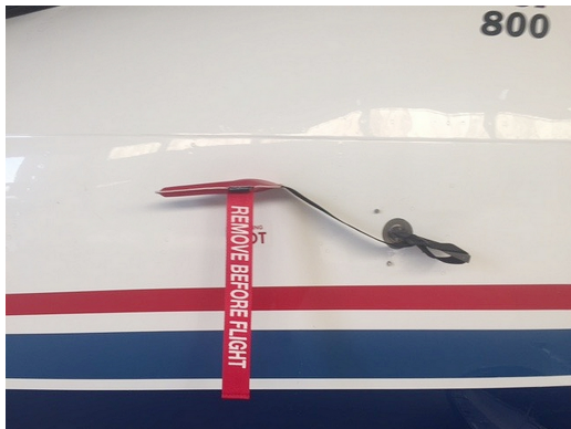
Hawker Beechcraft 800, 800XP, 850XP Pitot Covers With Aoa Straps

The Engine Inlet Plugs are custom fit for your British Aerospace Hawker 700 intakes, made with heavy-duty vinyl material, and stuffed with a single block of sculpted urethane foam. Each plug has a zipper that allows the foam to be removed and dried if necessary. Engine plugs have 'remove before flight' streamers sewn onto the face of the plugs. Most plugs are imprinted with the aircraft registration number in black for an extra charge. Storage bag NOT included. Engine plugs may be inserted after flight when the engine is still warm. Engine Inlet Plugs are commonly referred to as Cowl Plugs, Intake Plugs, Cowl Blocks, Engine Blocks, and Engine Bungs.