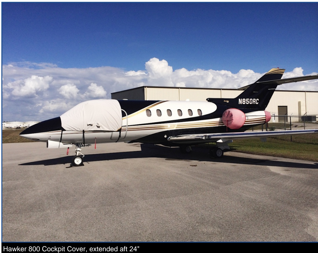
Hawker 800 Cockpit Cover, extended aft 24"