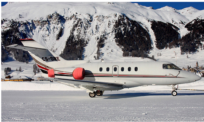
Hawker 800XP Tri-Fold Engine Intake/Exhaust Cover Set