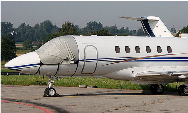
Hawker 800 Cockpit Cover