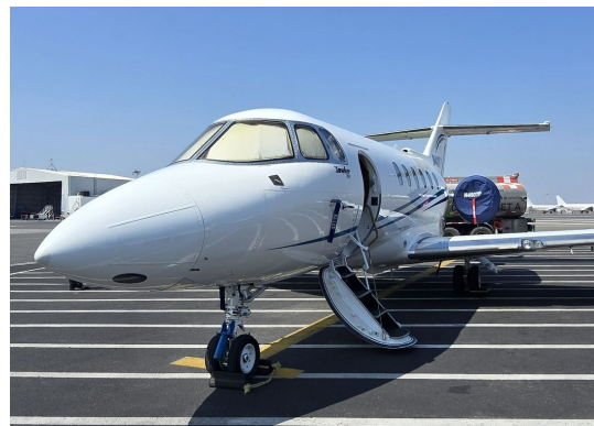
Hawker Beechcraft 750 Engine Covers, Cockpit HeatShields