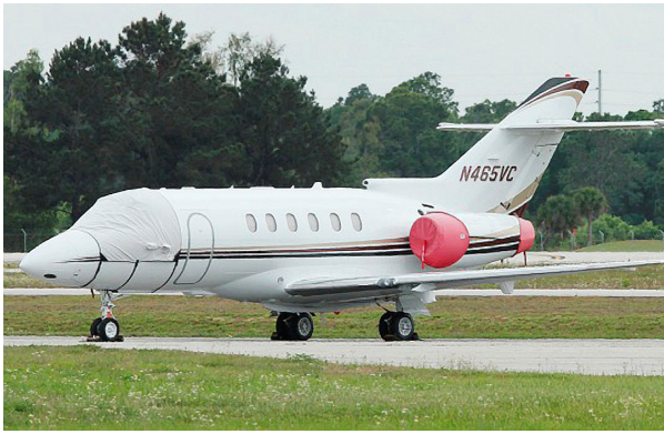
Hawker 800 Cockpit Cover and Engine Covers set