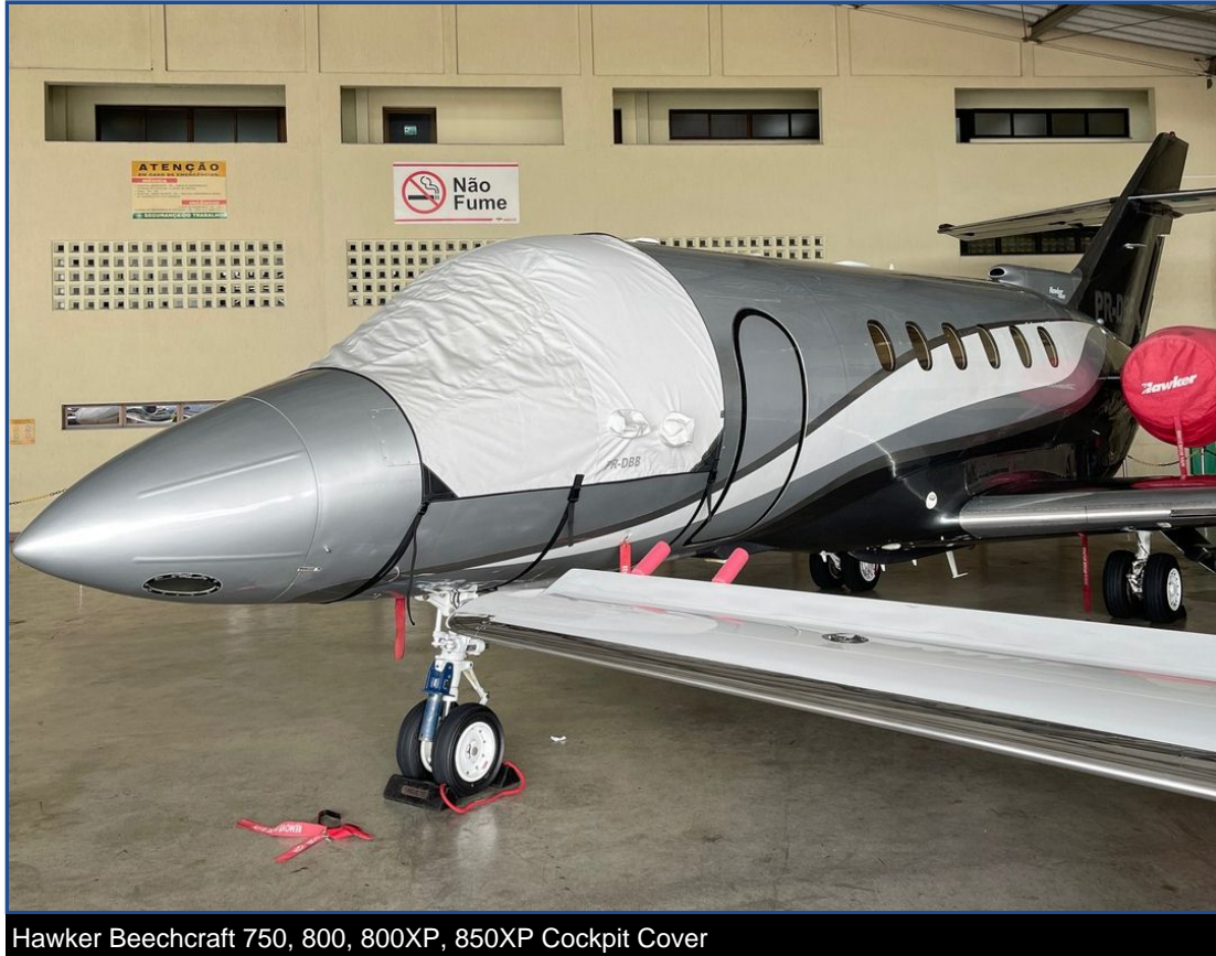
Hawker Beechcraft 750, 800, 800XP, 850XP Cockpit Cover