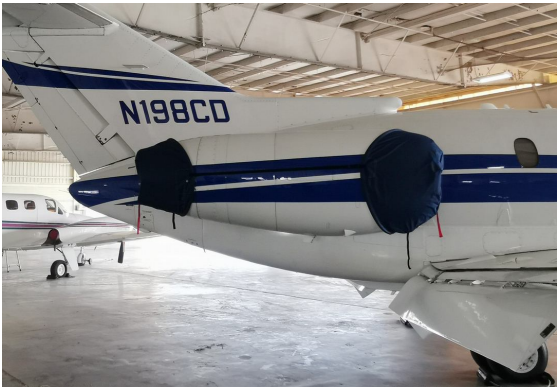
Hawker 750 Engine Covers

Cockpit Heatshields are interior sunshades for the aircraft's cockpit. The product is a unique composite of closed-cell foam with a silver mylar finish. The semi-rigid design is stiff enough to stand inside the window framing. The set folds up flat and is easily stored in the included storage sleeve. Some designs may require velcro and suction cups. Our Heatshields for jets are offered white side out because some aircraft manufacturers have issued advisories against reflective window inserts due to potential heat damage. A Heatshield is an excellent short-term remedy for cockpit overheating, but an external fabric cover is more effective for long-term protection.