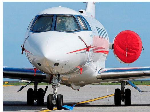
Hawker 800 Tri-Fold Engine Covers & Pitot Covers