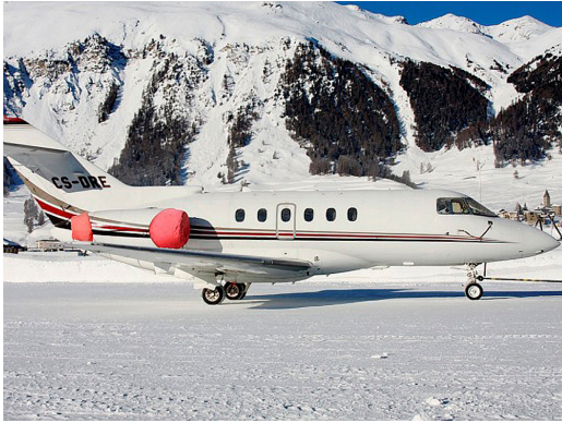
Hawker 800 Tri-Fold Engine Covers & Pitot Covers

instructions. The aircraft's registration number can be silkscreened onto the cover for an extra charge.