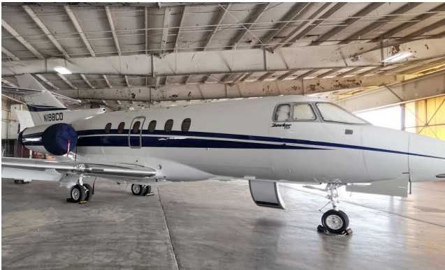
Hawker 750 HeatShields & Engine Covers