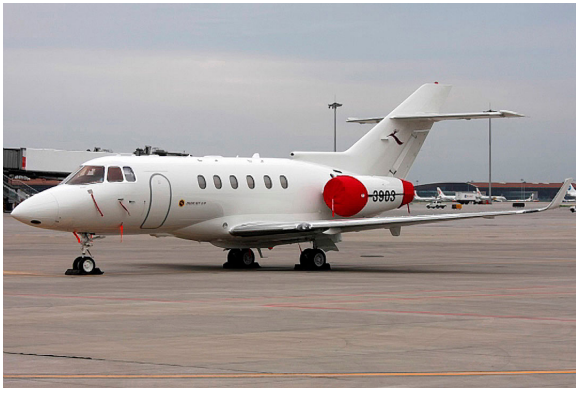
Hawker 900XP Tri-Fold Engine Intake/Exhaust Cover Set & Pitot AOA Cover Set