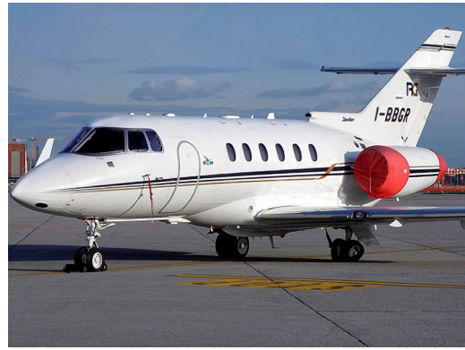
Hawker 900XP Tri-Fold Engine Intake/Exhaust Cover Set