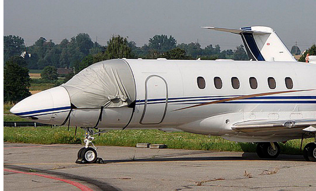
Hawker 800 Cockpit Cover

This cover type is made from Silver Acrylic Sunbrella canvas and is 100% lined with a soft and smooth microfiber. Bruce's Custom Covers developed this material combination especially for aircraft protection. The outer material is medium weight and treated for water resistance, UV resistance and anti-static buildup. The inner lining is a very soft and smooth microfiber to prevent scratching. The material is very reflective, and tests show that the cabin interior temperature can be reduced to near-ambient temperature on the hottest of days. It is water, ice and snow repellent, yet breathable to allow moisture to escape from between the cover and the aircraft surface.