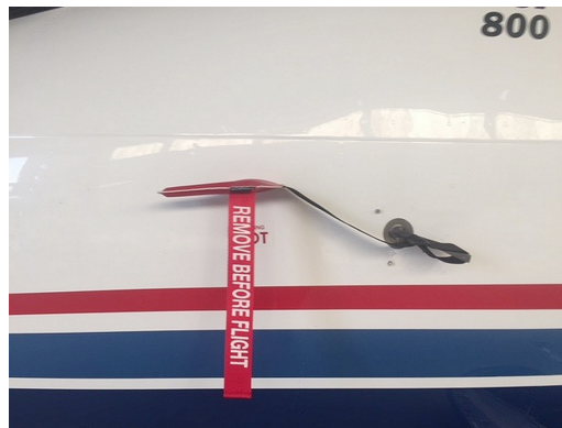
Hawker Beechcraft 800, 800XP, 850XP Pitot Covers With Aoa Straps

The Engine Inlet Plugs are custom fit for your Hawker Beechcraft 900XP intakes, made with heavy-duty vinyl material, and stuffed with a single block of sculpted urethane foam. Each plug has a zipper that allows the foam to be removed and dried if necessary. Engine plugs have 'remove before flight' streamers sewn onto the face of the plugs. Most plugs are imprinted with the aircraft registration number in black for an extra charge. Storage bag NOT included. Engine plugs may be inserted after flight when the engine is still warm. Engine Inlet Plugs are commonly referred to as Cowl Plugs, Intake Plugs, Cowl Blocks, Engine Blocks, and Engine Bunges.