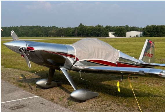
Harmon Rocket Travel Light Weight Canopy Cover Std Windshield