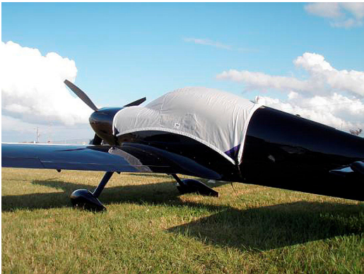
Harmon Rocket Canopy Cover