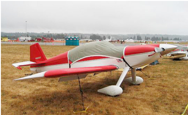
Harmon Rocket Canopy Cover & Engine Inlet Plugs