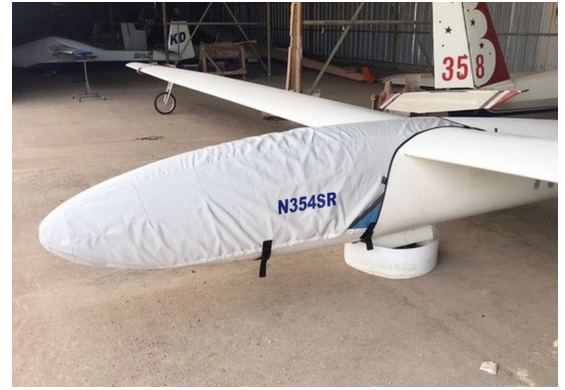
HBV-Diamant 16.5 Canopy/Nose Cover