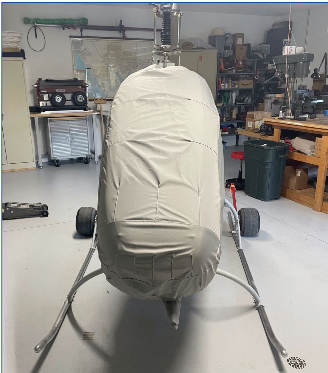
Eagle Helicycle Bubble Cover