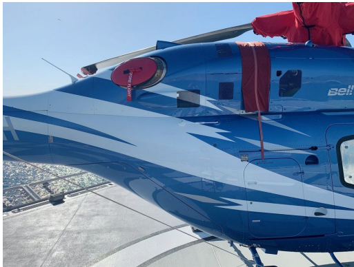
Bell 429 Exhaust Plug, Rotor Mast Cover

The Engine Exhaust Plugs are custom fit for your Eagle R&D Helicycle exhaust openings, made with heavy-duty vinyl material, and stuffed with a single block of sculpted urethane foam. Exhaust plugs have 'Remove Before Flight' streamers sewn onto the face of the plugs. Exhaust plugs may be inserted soon after flight when the engine is still warm. Engine Inlet Plugs are commonly referred to as Cowl Plugs, Intake Plugs, Cowl Blocks, Engine Blocks, and Engine Bungs.