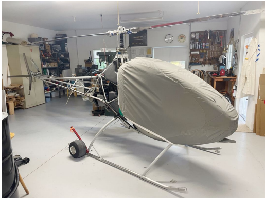
Eagle Helicycle Bubble Cover