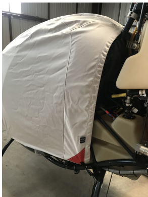
Helicycle Bubble Cover

This cover type is made from Silver Acrylic Sunbrella canvas and is 100% lined with a soft and smooth microfiber. Bruce's Custom Covers developed this material combination especially for aircraft protection. The outer material is medium weight and treated for water resistance, UV resistance and anti-static buildup. The inner lining is a very soft and smooth microfiber to prevent scratching. The material is very reflective, and tests show that the cabin interior temperature can be reduced to near-ambient temperature on the hottest of days. It is water, ice and snow repellent, yet breathable to allow moisture to escape from between the cover and the aircraft surface.