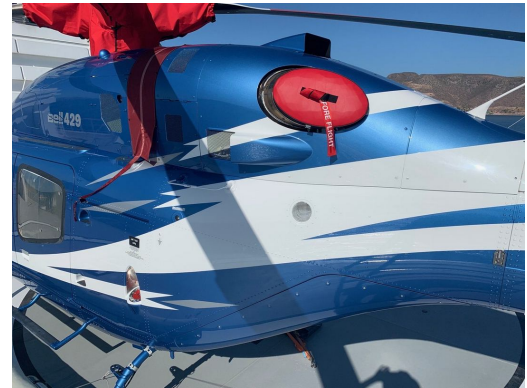
Bell 429 Exhaust Plug