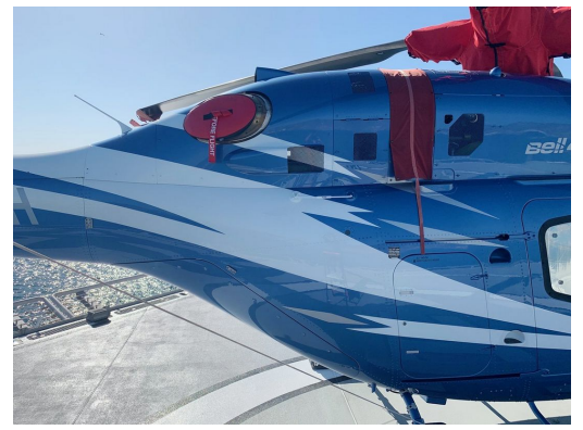
Bell 429 Exhaust Plug, Rotor Mast Cover