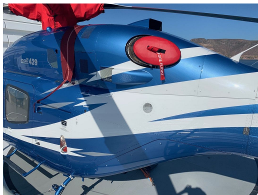
Bell 429 Exhaust Plug

The Engine Exhaust Plugs are custom fit for your Eagle R&D Helicycle exhaust openings, made with heavy-duty vinyl material, and stuffed with a single block of sculpted urethane foam. Exhaust plugs have 'Remove Before Flight' streamers sewn onto the face of the plugs. Exhaust plugs may be inserted soon after flight when the engine is still warm. Engine Inlet Plugs are commonly referred to as Cowl Plugs, Intake Plugs, Cowl Blocks, Engine Blocks, and Engine Bungs.