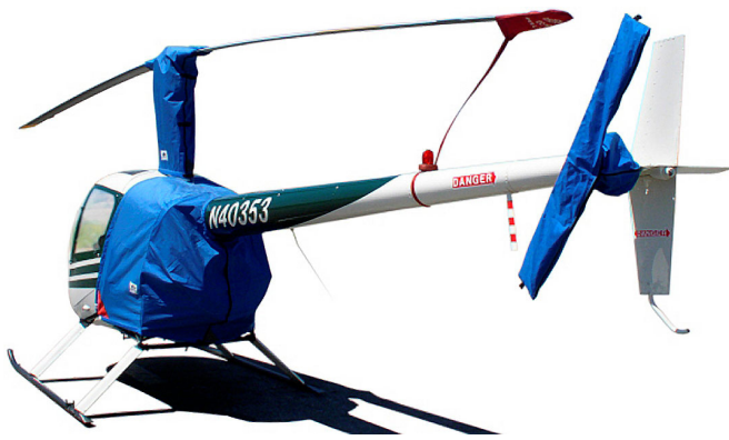
Robinson R-22 Engine, Rotor Mast & Tail Rotor Covers, with Blade Tie-down