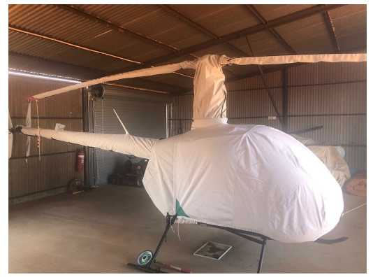
Robinson R-22 Full Cover Set