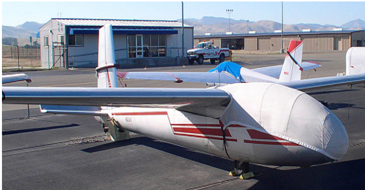
Blanik L13 Canopy/Nose Cover