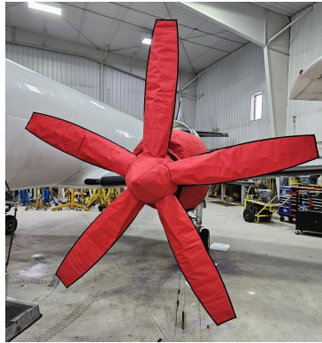
Fairchild Metro 5 Blade Insulated Insulated Prop Covers

The material is very reflective, and tests show that the cabin interior temperature can be reduced to near-ambient temperature on the hottest of days. It is water, ice and snow repellent, yet breathable to allow moisture to escape from between the cover and the aircraft surface.