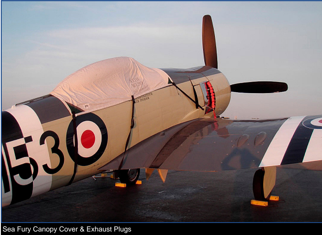
Sea Fury Canopy Cover & Exhaust Plugs