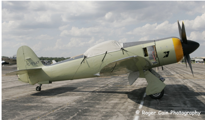
Hawker Sea Fury Canopy Cover

This cover type is made from Silver Acrylic Sunbrella canvas and is 100% lined with a soft and smooth microfiber. Bruce's Custom Covers developed this material combination especially for aircraft protection. The outer material is medium weight and treated for water resistance, UV resistance and anti-static buildup. The inner lining is a very soft and smooth microfiber to prevent scratching. The material is very reflective, and tests show that the cabin interior temperature can be reduced to near-ambient temperature on the hottest of days. It is water, ice and snow repellent, yet breathable to allow moisture to escape from between the cover and the aircraft surface.