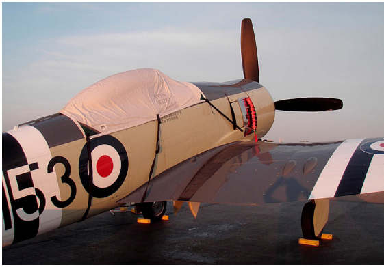
Sea Fury Canopy Cover & Exhaust Plugs