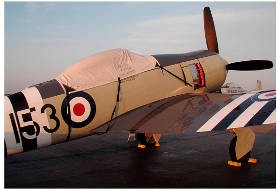
Sea Fury Canopy Cover & Exhaust Plugs