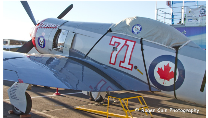
Hawker Sea Fury Canopy Cover