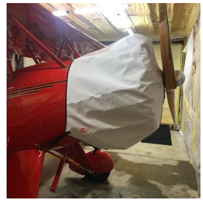
Hatz Biplane CB-1 Engine Cover