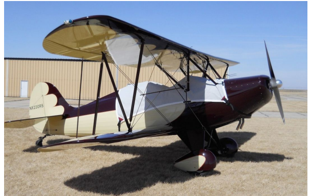
Hatz Biplane Canopy Cover