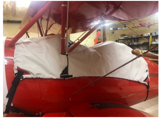
Hatz Biplane CB-1 Canopy Cover