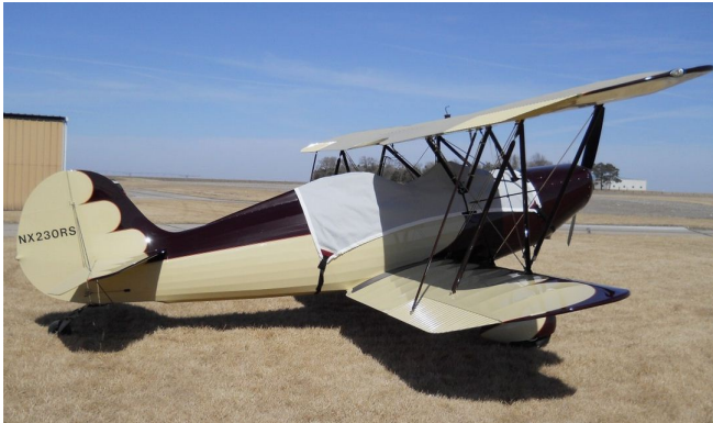
Hatz Biplane Canopy Cover

This cover type is made from Silver Acrylic Sunbrella canvas and is 100% lined with a soft and smooth microfiber. Bruce's Custom Covers developed this material combination especially for aircraft protection. The outer material is medium weight and treated for water resistance, UV resistance and anti-static buildup. The inner lining is a very soft and smooth microfiber to prevent scratching. The material is very reflective, and tests show that the cabin interior temperature can be reduced to near-ambient temperature on the hottest of days. It is water, ice and snow repellent, yet breathable to allow moisture to escape from between the cover and the aircraft surface.