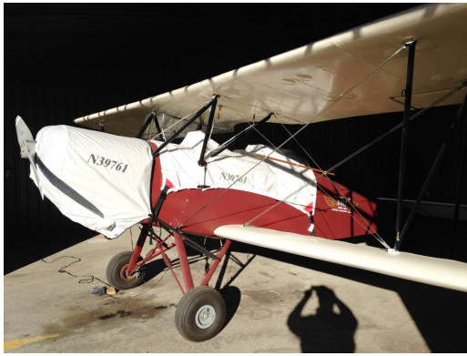
Hatz Biplane Canopy and Engine Covers