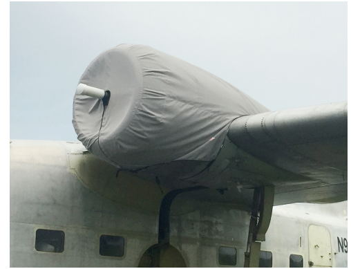
Grumman Albatross Engine Covers