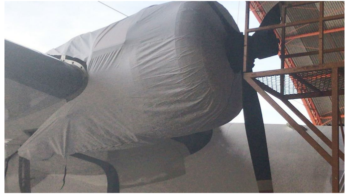
Grumman HU-16 Albatross Engine Cover (test fit cover)