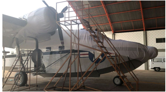
Grumman HU-16 Albatross Cockpit/Nose Cover and Engine Cover(test fit covers)