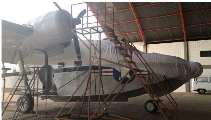
Grumman HU-16 Albatross Cockpit/Nose Cover and Engine Cover(test fit covers)

This cover type is made from Silver Acrylic Sunbrella canvas and is 100% lined with a soft and smooth microfiber. Bruce's Custom Covers developed this material combination especially for aircraft protection. The outer material is medium weight and treated for water resistance, UV resistance and anti-static buildup. The inner lining is a very soft and smooth microfiber to prevent scratching. The material is very reflective, and tests show that the cabin interior temperature can be reduced to near-ambient temperature on the hottest of days. It is water, ice and snow repellent, yet breathable to allow moisture to escape from between the cover and the aircraft surface.