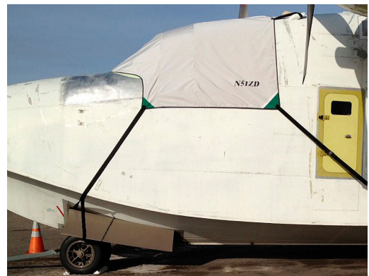
Grumman HU-16 Albatross Canopy Cover