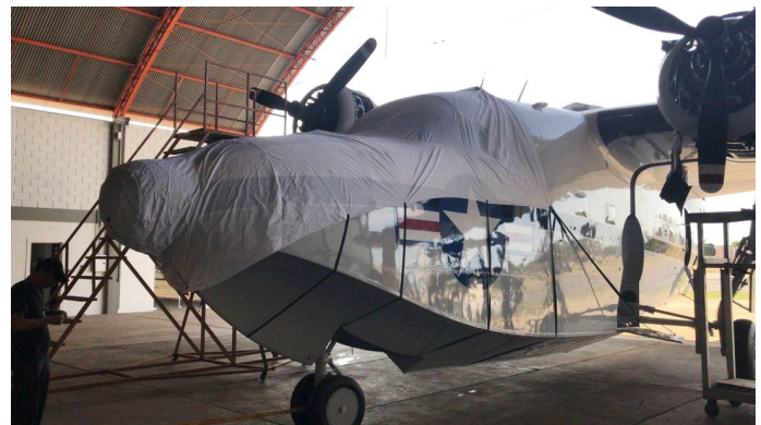
Grumman HU-16 Albatross Cockpit/Nose Cover (test fit cover)