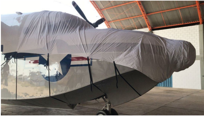
Grumman HU-16 Albatross Cockpit/Nose Cover (test fit cover)

This cover type is made from Silver Acrylic Sunbrella canvas and is 100% lined with a soft and smooth microfiber. Bruce's Custom Covers developed this material combination especially for aircraft protection. The outer material is medium weight and treated for water resistance, UV resistance and anti-static buildup. The inner lining is a very soft and smooth microfiber to prevent scratching. The material is very reflective, and tests show that the cabin interior temperature can be reduced to near-ambient temperature on the hottest of days. It is water, ice and snow repellent, yet breathable to allow moisture to escape from between the cover and the aircraft surface.