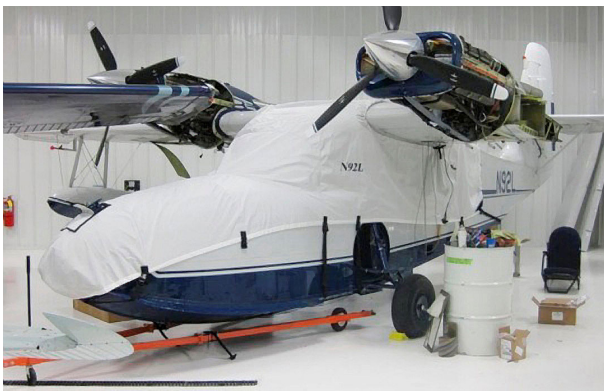
Grumman G44 Widgeon Canopy/Nose Cover

This cover type is made from Silver Acrylic Sunbrella canvas and is 100% lined with a soft and smooth microfiber. Bruce's Custom Covers developed this material combination especially for aircraft protection. The outer material is medium weight and treated for water resistance, UV resistance and anti-static buildup. The inner lining is a very soft and smooth microfiber to prevent scratching. The material is very reflective, and tests show that the cabin interior temperature can be reduced to near-ambient temperature on the hottest of days. It is water, ice and snow repellent, yet breathable to allow moisture to escape from between the cover and the aircraft surface.