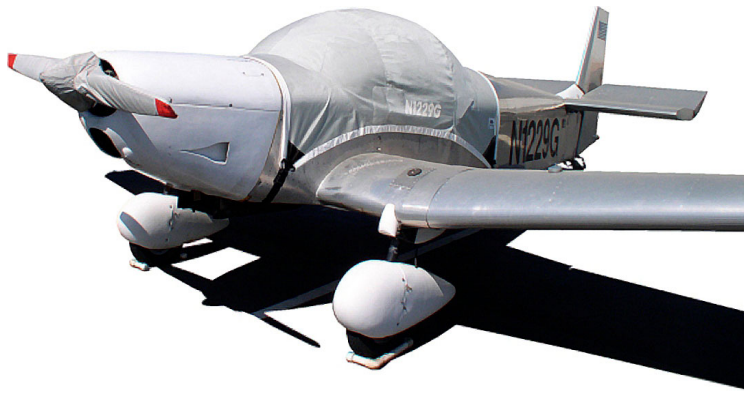
Zenith CH601 Canopy Cover & Prop Cover