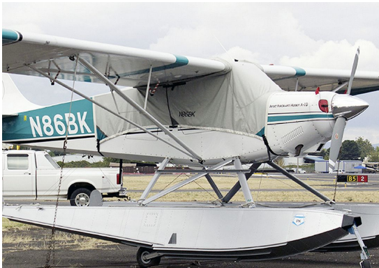
Aviat Husky Canopy Cover and Inlet Plugs