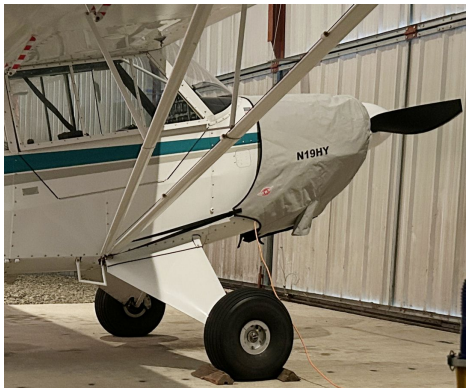
Aviat Husky A-1A Insulated Engine Cover

This cover type is made from Silver Acrylic Sunbrella canvas and is 100% lined with a soft and smooth microfiber. Bruce's Custom Covers developed this material combination especially for aircraft protection. The outer material is medium weight and treated for water resistance, UV resistance and anti-static buildup. The inner lining is a very soft and smooth microfiber to prevent scratching. The material is very reflective, and tests show that the cabin interior temperature can be reduced to near-ambient temperature on the hottest of days. It is water, ice and snow repellent, yet breathable to allow moisture to escape from between the cover and the aircraft surface.