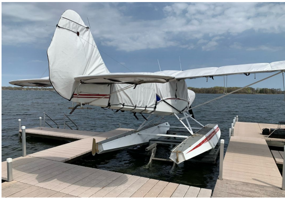
Aviat Husky Empennage Cover

WINTER USE MATERIAL - Made with Solution-Dyed Polyester fabric, this option is intended for seasonal use to aid in deicing, rain mitigation, or for occasional travel. The material is lighter and more compact, but more susceptible to UV damage and may have a shorter useful life if used continuously outside than the all-year use material.