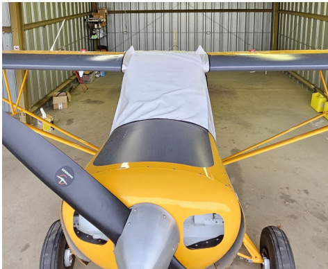
Piper PA-12: Super Cruiser, J5 Cub Windshield/Skylight Cover