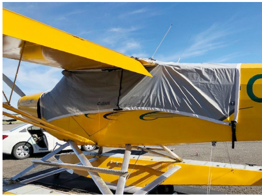
Sportsman 2+2 Wag Aero Light Weight Over the Top Travel Canopy Cover

This cover type is made from Silver Acrylic Sunbrella canvas and is 100% lined with a soft and smooth microfiber. Bruce's Custom Covers developed this material combination especially for aircraft protection. The outer material is medium weight and treated for water resistance, UV resistance and anti-static buildup. The inner lining is a very soft and smooth microfiber to prevent scratching. The material is very reflective, and tests show that the cabin interior temperature can be reduced to near-ambient temperature on the hottest of days. It is water, ice and snow repellent, yet breathable to allow moisture to escape from between the cover and the aircraft surface.