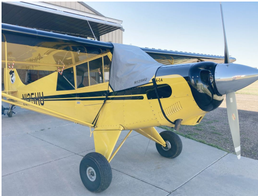
Aviat Husky Windshield/Skylight Cover

This cover type is made from Silver Acrylic Sunbrella canvas and is 100% lined with a soft and smooth microfiber. Bruce's Custom Covers developed this material combination especially for aircraft protection. The outer material is medium weight and treated for water resistance, UV resistance and anti-static buildup. The inner lining is a very soft and smooth microfiber to prevent scratching. The material is very reflective, and tests show that the cabin interior temperature can be reduced to near-ambient temperature on the hottest of days. It is water, ice and snow repellent, yet breathable to allow moisture to escape from between the cover and the aircraft surface.