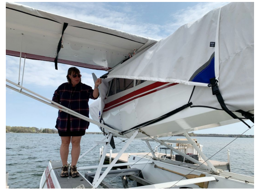
Aviat Husky Canopy, Wing, Empennage Covers