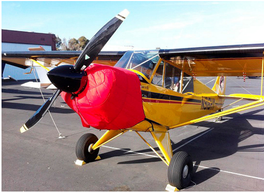
Aviat Husky Insulated Engine Cover