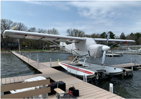
Aviat Husky Canopy, Engine, Wing, Empennage Covers

This cover type is made from Silver Acrylic Sunbrella canvas and is 100% lined with a soft and smooth microfiber. Bruce's Custom Covers developed this material combination especially for aircraft protection. The outer material is medium weight and treated for water resistance, UV resistance and anti-static buildup. The inner lining is a very soft and smooth microfiber to prevent scratching. The material is very reflective, and tests show that the cabin interior temperature can be reduced to near-ambient temperature on the hottest of days. It is water, ice and snow repellent, yet breathable to allow moisture to escape from between the cover and the aircraft surface.