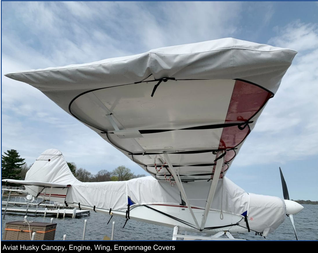
Aviat Husky Canopy, Engine, Wing, Empennage Covers