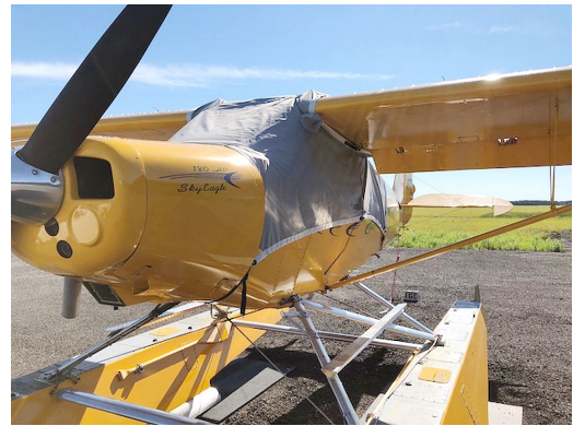
Sportsman 2+2 Wag Aero Light Weight Over the Top Travel Canopy Cover