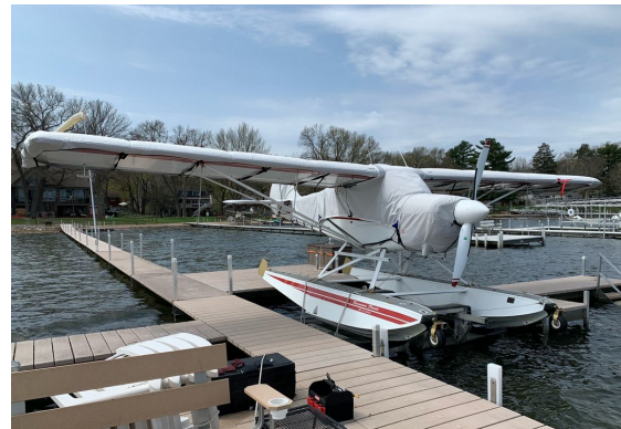
Aviat Husky Canopy, Engine, Wing, Empennage Covers