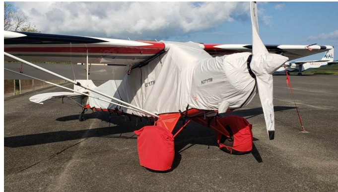
Aviat Husky Extended Canopy Cover, Engine, Prop, Empennage & Tire Covers