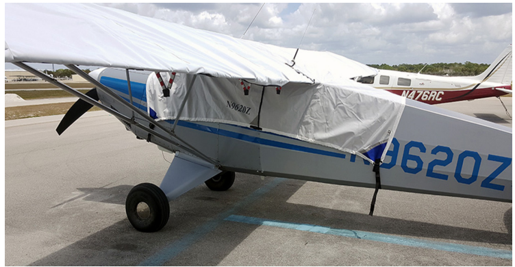
Aviat (Christen) Husky Wing Covers, All Year Use