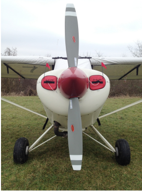
Aviat Husky Engine Plugs, Wing Covers

Engine Inlet Plugs are custom fit for your Aviat (Christen) Husky intakes, made with heavy-duty vinyl material, and stuffed with a single block of sculpted urethane foam. Each plug has a zipper that allows the foam to be removed and dried if necessary. Engine plugs have warning flags that are visible from the cockpit or 'remove before flight' streamers sewn onto the face of the plugs. Most plugs are imprinted with the aircraft registration number in black for an extra charge. Storage bag NOT included. Engine plugs may be inserted after flight when the engine is still warm. Engine Inlet Plugs are commonly referred to as Cowl Plugs, Intake Plugs, Cowl Blocks, Engine Blocks, and Engine Bungs.