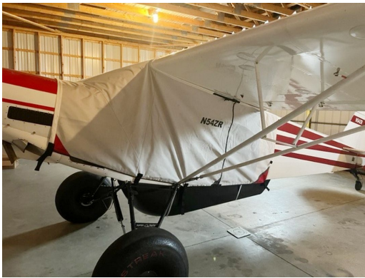
Piper PA-11 Extended Canopy Cover, Over the Top Style

This cover type is made from Silver Acrylic Sunbrella canvas and is 100% lined with a soft and smooth microfiber. Bruce's Custom Covers developed this material combination especially for aircraft protection. The outer material is medium weight and treated for water resistance, UV resistance and anti-static buildup. The inner lining is a very soft and smooth microfiber to prevent scratching. The material is very reflective, and tests show that the cabin interior temperature can be reduced to near-ambient temperature on the hottest of days. It is water, ice and snow repellent, yet breathable to allow moisture to escape from between the cover and the aircraft surface.