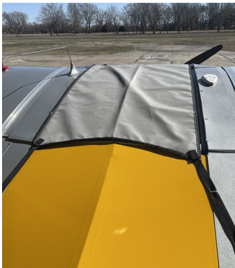
Piper PA-18 Windshield/Skylight Cover

This cover type is made from Silver Acrylic Sunbrella canvas and is 100% lined with a soft and smooth microfiber. Bruce's Custom Covers developed this material combination especially for aircraft protection. The outer material is medium weight and treated for water resistance, UV resistance and anti-static buildup. The inner lining is a very soft and smooth microfiber to prevent scratching. The material is very reflective, and tests show that the cabin interior temperature can be reduced to near-ambient temperature on the hottest of days. It is water, ice and snow repellent, yet breathable to allow moisture to escape from between the cover and the aircraft surface.