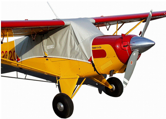
Aviat Husky Canopy Cover & Engine Plugs

Engine Inlet Plugs are custom fit for your Aviat (Christen) Husky intakes, made with heavy-duty vinyl material, and stuffed with a single block of sculpted urethane foam. Each plug has a zipper that allows the foam to be removed and dried if necessary. Engine plugs have warning flags that are visible from the cockpit or 'remove before flight' streamers sewn onto the face of the plugs. Most plugs are imprinted with the aircraft registration number in black for an extra charge. Storage bag NOT included. Engine plugs may be inserted after flight when the engine is still warm. Engine Inlet Plugs are commonly referred to as Cowl Plugs, Intake Plugs, Cowl Blocks, Engine Blocks, and Engine Bungs.