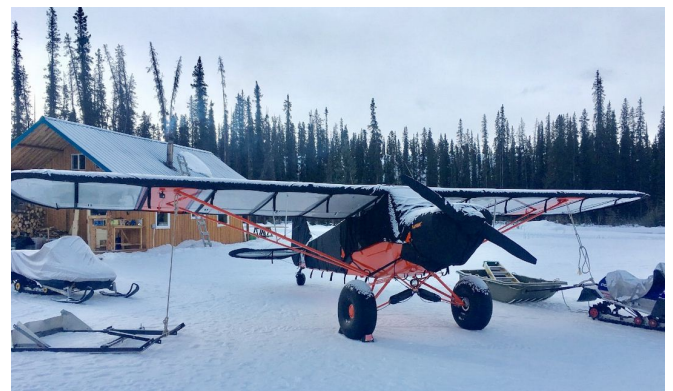
Piper PA-18 Super Cub Canopy Cover (Over-The-Top Style)