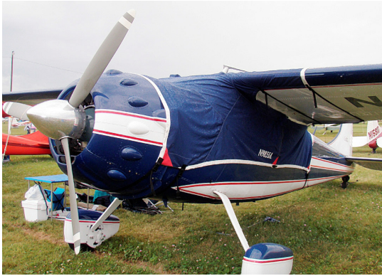
Cessna 195 Canopy Cover, extended forward and over gas caps

This cover type is made from Silver Acrylic Sunbrella canvas and is 100% lined with a soft and smooth microfiber. Bruce's Custom Covers developed this material combination especially for aircraft protection. The outer material is medium weight and treated for water resistance, UV resistance and anti-static buildup. The inner lining is a very soft and smooth microfiber to prevent scratching. The material is very reflective, and tests show that the cabin interior temperature can be reduced to near-ambient temperature on the hottest of days. It is water, ice and snow repellent, yet breathable to allow moisture to escape from between the cover and the aircraft surface.