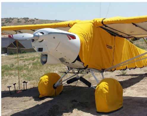
Piper PA-18 Super Cub Extended Canopy Cover, Wing & Tire Covers

WINTER USE MATERIAL - Made with Solution-Dyed Polyester fabric, this option is intended for seasonal use to aid in deicing, rain mitigation, or for occasional travel. The material is lighter and more compact, but more susceptible to UV damage and may have a shorter useful life if used continuously outside than the all-year use material.