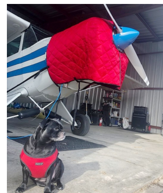
Piper PA-12 Insulated Hangar Blanket