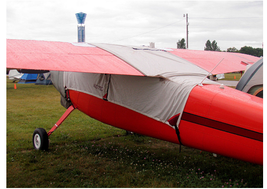
Over-Top Canopy Cover & Engine Cover