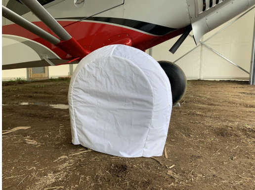
Cub Crafters CC19 Oversize Tire Covers, test fit cover

ALL-YEAR USE MATERIAL - Made with Silver Acrylic Sunbrella canvas, the all-year use material is the best option for sun protection and cover longevity. This heavier more durable material is intended for all weather conditions, such as rain and snow or lots of sun.