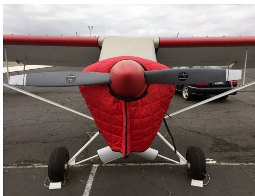
FOR INTERIOR USE. Cub Crafters CC-11 Insulated Hangar Blanket, available in Red or Silver

This cover type is made from Silver Acrylic Sunbrella canvas and is 100% lined with a soft and smooth microfiber. Bruce's Custom Covers developed this material combination especially for aircraft protection. The outer material is medium weight and treated for water resistance, UV resistance and anti-static buildup. The inner lining is a very soft and smooth microfiber to prevent scratching. The material is very reflective, and tests show that the cabin interior temperature can be reduced to near-ambient temperature on the hottest of days. It is water, ice and snow repellent, yet breathable to allow moisture to escape from between the cover and the aircraft surface.