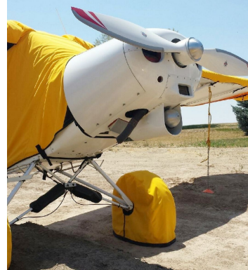
Piper PA-18 Super Cub Extended Canopy Cover, Wing & Tire Covers