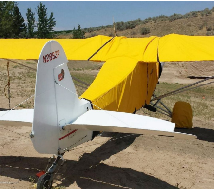
Cub Crafters CC19 Oversize Tire Covers, test fit cover Piper PA-18 Super Cub Extended Canopy Cover, Wing & Tire Covers