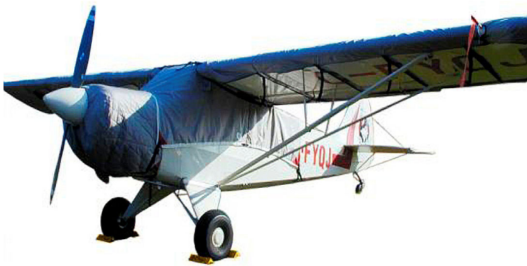
Aviat Husky Insulated Engine Cover, Canopy & Wing Covers

This cover type is made from Silver Acrylic Sunbrella canvas and is 100% lined with a soft and smooth microfiber. Bruce's Custom Covers developed this material combination especially for aircraft protection. The outer material is medium weight and treated for water resistance, UV resistance and anti-static buildup. The inner lining is a very soft and smooth microfiber to prevent scratching. The material is very reflective, and tests show that the cabin interior temperature can be reduced to near-ambient temperature on the hottest of days. It is water, ice and snow repellent, yet breathable to allow moisture to escape from between the cover and the aircraft surface.