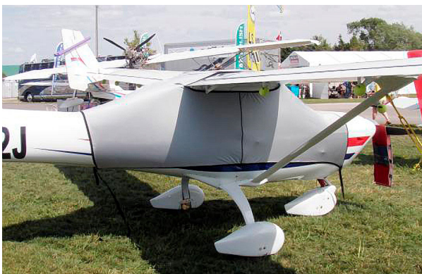
Jabiru Spandex FlyAway Travel Canopy Cover

Travel Covers are made with Silver Solution-Dyed Polyester fabric and only lined over the windshield to save weight. The material is lightweight and more compact for easy stowage in the aircraft. The polyester material is water resistant, but only intended for occasional use outside. We also have an ultra lightweight material available for fitted hangar dust covers. For daily outdoor use, the non-travel Sunbrella Cover is the best choice.