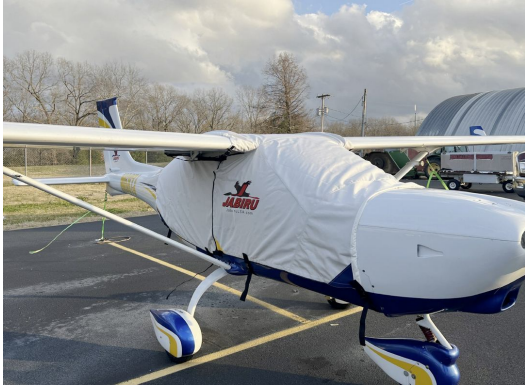
Jabiru J230-SP Extended Canopy Cover

This cover type is made from Silver Acrylic Sunbrella canvas and is 100% lined with a soft and smooth microfiber. Bruce's Custom Covers developed this material combination especially for aircraft protection. The outer material is medium weight and treated for water resistance, UV resistance and anti-static buildup. The inner lining is a very soft and smooth microfiber to prevent scratching. The material is very reflective, and tests show that the cabin interior temperature can be reduced to near-ambient temperature on the hottest of days. It is water, ice and snow repellent, yet breathable to allow moisture to escape from between the cover and the aircraft surface.