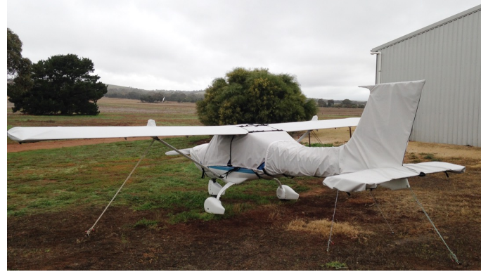
Jabiru 160 Canopy, Engine, Prop, Wings & Empennage Covers