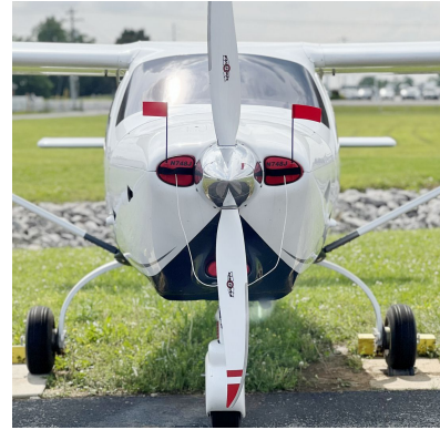
Jabiru J230-SP Engine Inlet Plugs