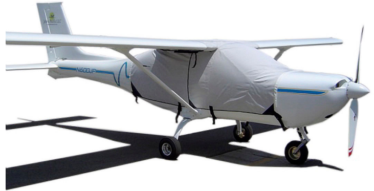
Jabiru Extended Canopy Cover