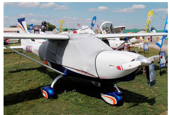
Jabiru Spandex FlyAway Travel Canopy Cover