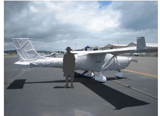
Jabiru J430 Complete Cover Set