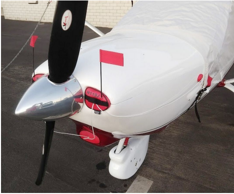
Jabiru 430 Engine Inlet Plugs