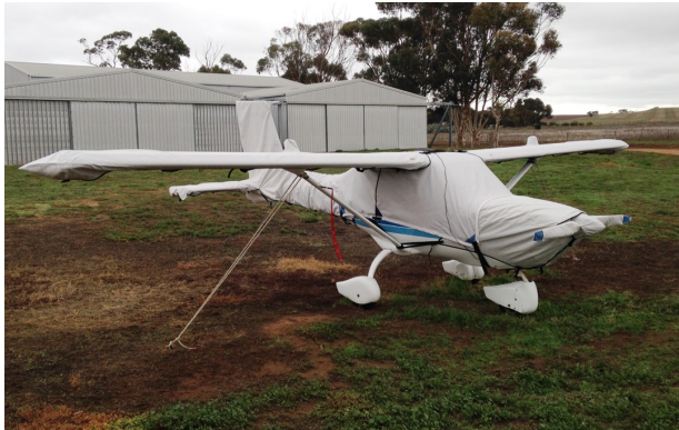
Jabiru 160 Canopy, Engine, Prop, Wings & Empennage Covers

WINTER USE MATERIAL - Made with Solution-Dyed Polyester fabric, this option is intended for seasonal use to aid in deicing, rain mitigation, or for occasional travel. The material is lighter and more compact, but more susceptible to UV damage and may have a shorter useful life if used continuously outside than the all-year use material.