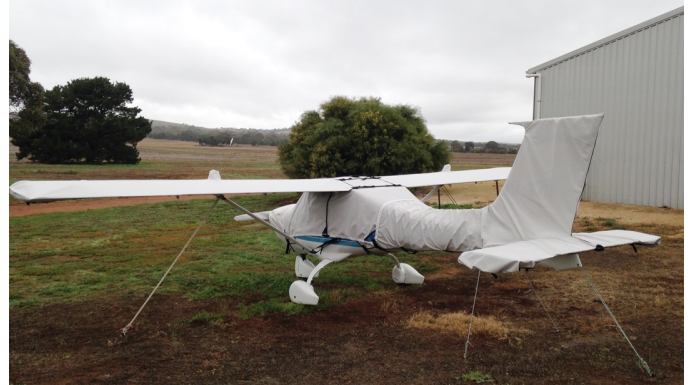
Jabiru 160 Canopy, Engine, Prop, Wings & Empennage Covers Jabiru 160 Canopy, Engine, Prop, Wings & Empennage Covers