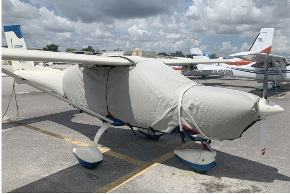
Jabiru 230D Extended Canopy Cover & Engine Covers

This cover type is made from Silver Acrylic Sunbrella canvas and is 100% lined with a soft and smooth microfiber. Bruce's Custom Covers developed this material combination especially for aircraft protection. The outer material is medium weight and treated for water resistance, UV resistance and anti-static buildup. The inner lining is a very soft and smooth microfiber to prevent scratching. The material is very reflective, and tests show that the cabin interior temperature can be reduced to near-ambient temperature on the hottest of days. It is water, ice and snow repellent, yet breathable to allow moisture to escape from between the cover and the aircraft surface.