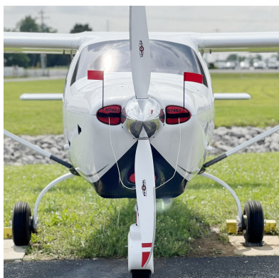
Jabiru J230-SP Engine Inlet Plugs