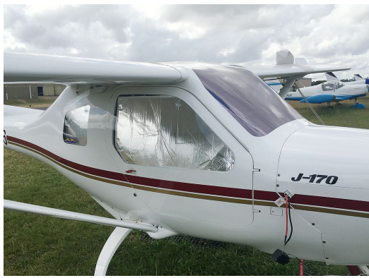
Jabiru 170 Heatshield Set